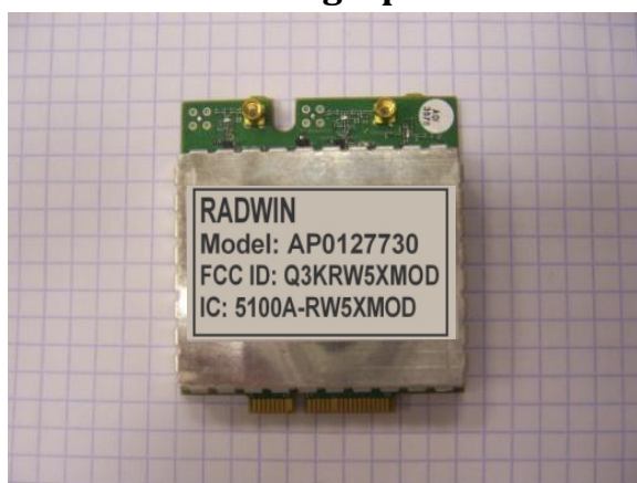
Module with the RF shielding and Label