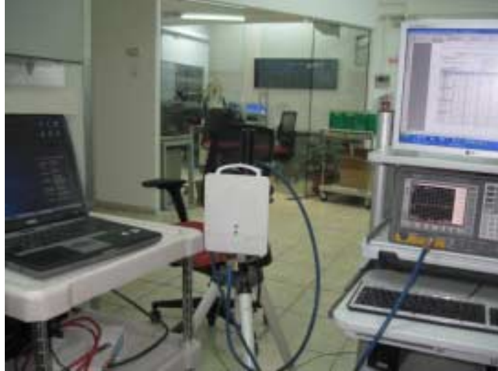
Photograph No.1 Peak output power, occupied bandwidth and spurious emissions measurement setup