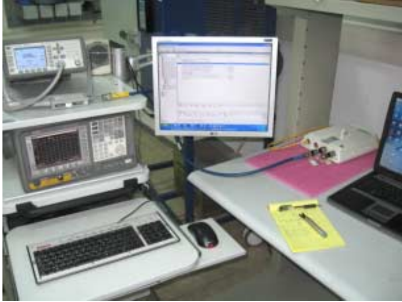
Photograph No.1 Peak output power measurement setup