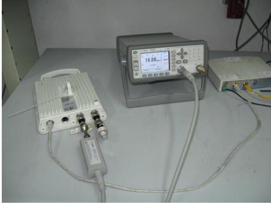
Photograph No.1 Peak output power measurement setup