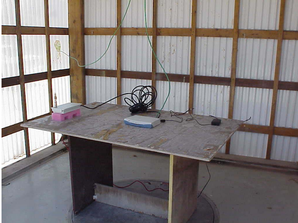
OATS measurement set up