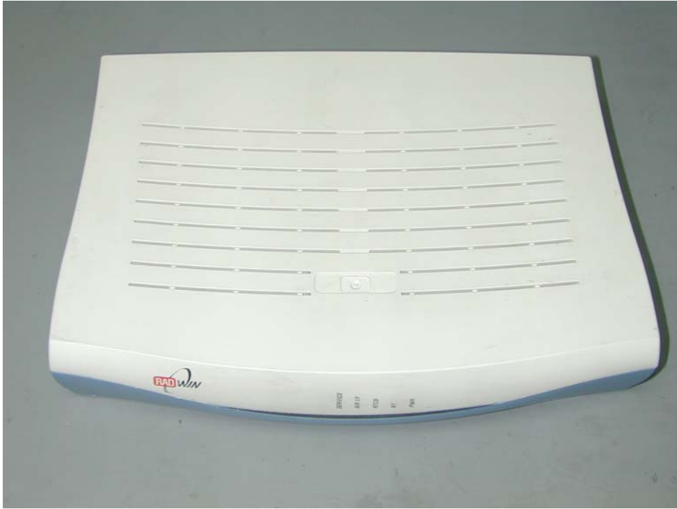
Indoor unit. External view