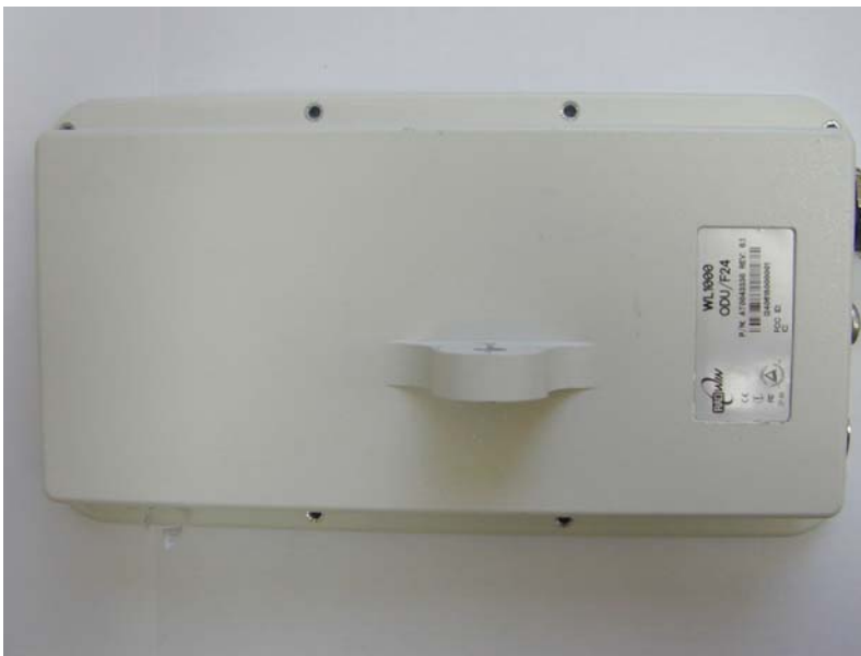
External view of the outdoor unit. Bottom