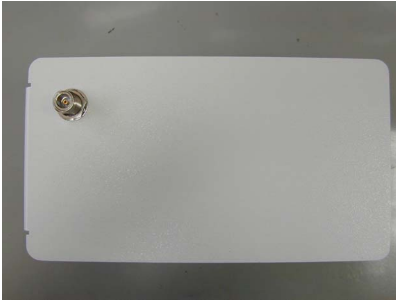
External view of the outdoor unit. Top