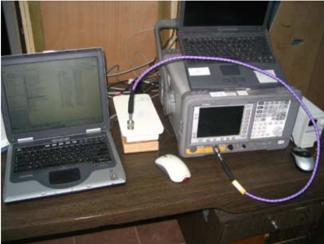
Photograph No.1 Peak output power, power spectral density, occupied bandwidth, spurious emissions at RF antenna connector measurement setup