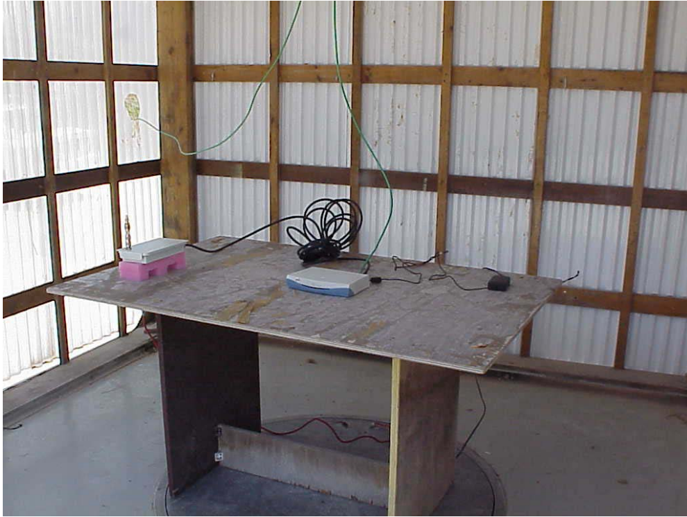
OATS measurement set up.