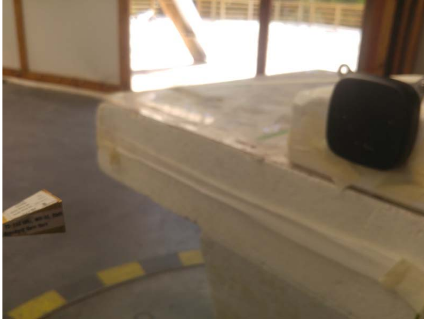
Photograph No.1 Peak output power measurement setup at the OATS