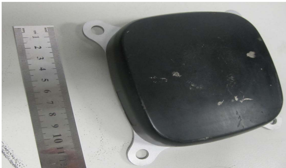
Photograph No.1 RADWIN 6000 6C00 transceiver general view