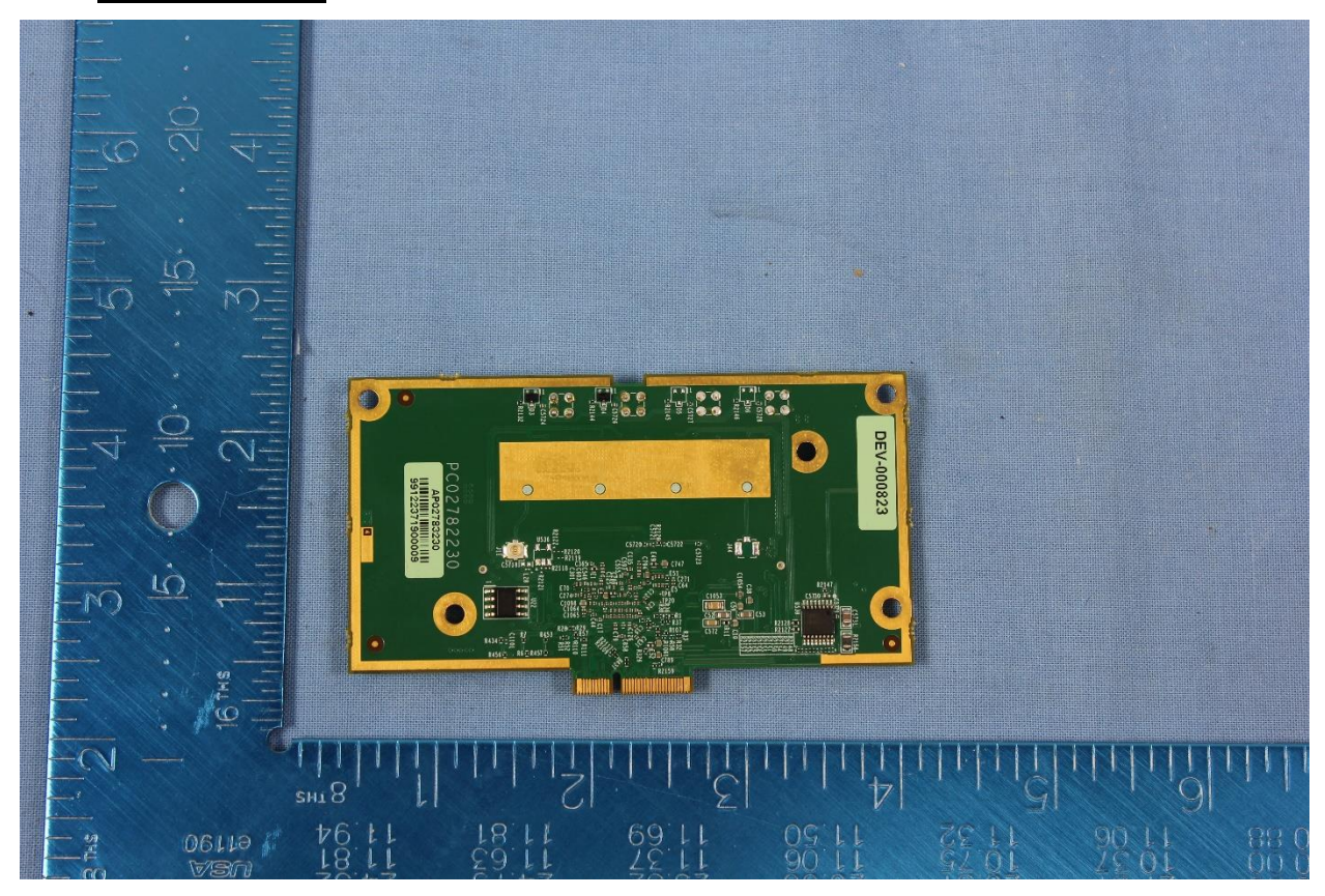
RF Board Back View