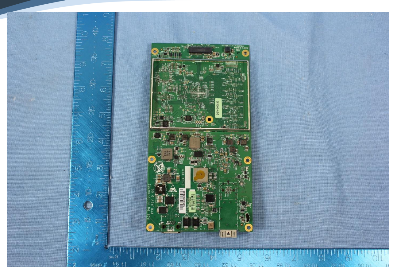
Main Board Front View