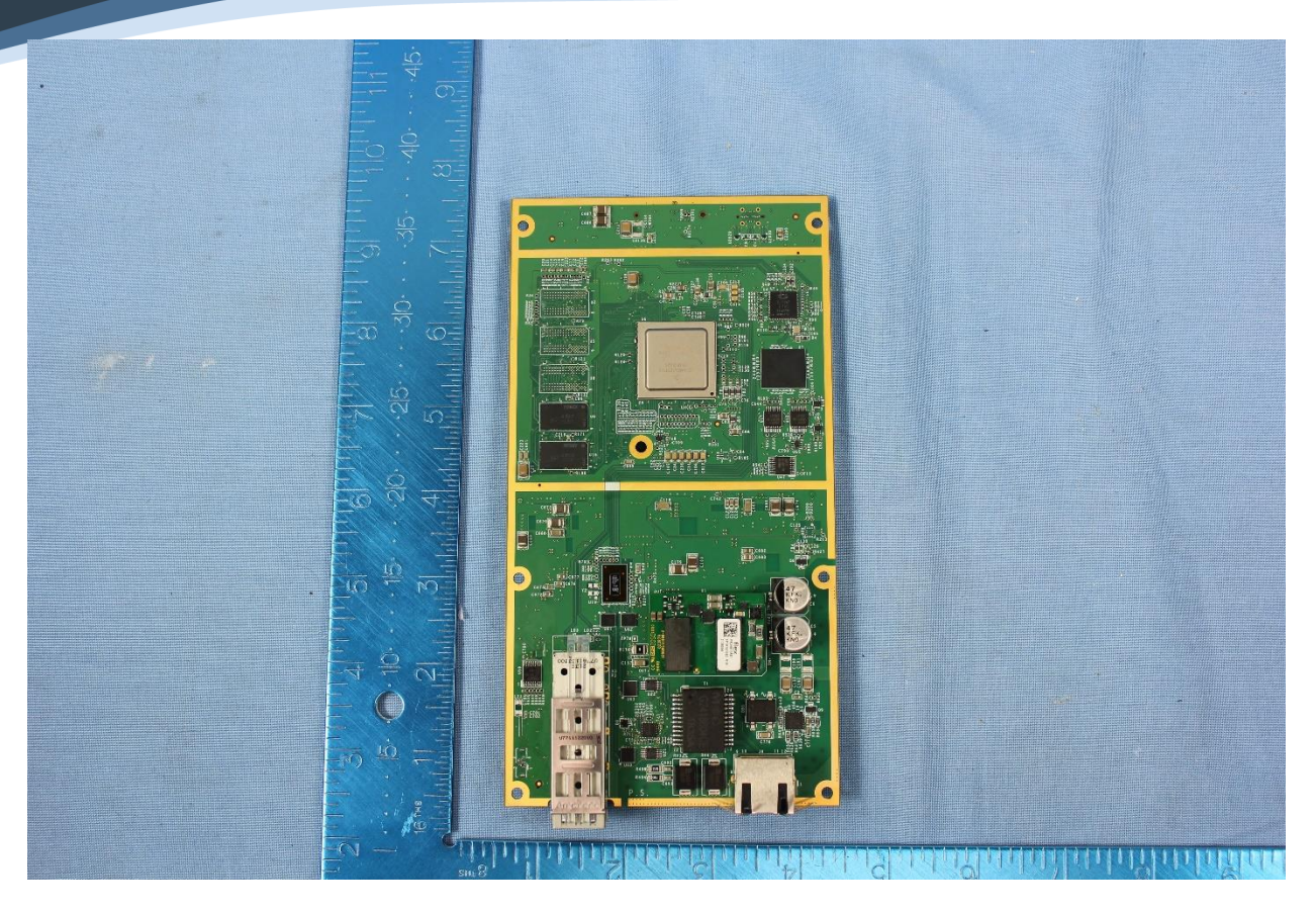
Main Board Back View