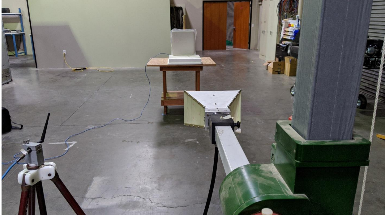
Radiated DFS Antenna View