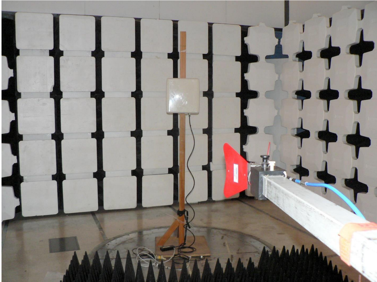
RDWN69 TX Spurious 1-18GHz