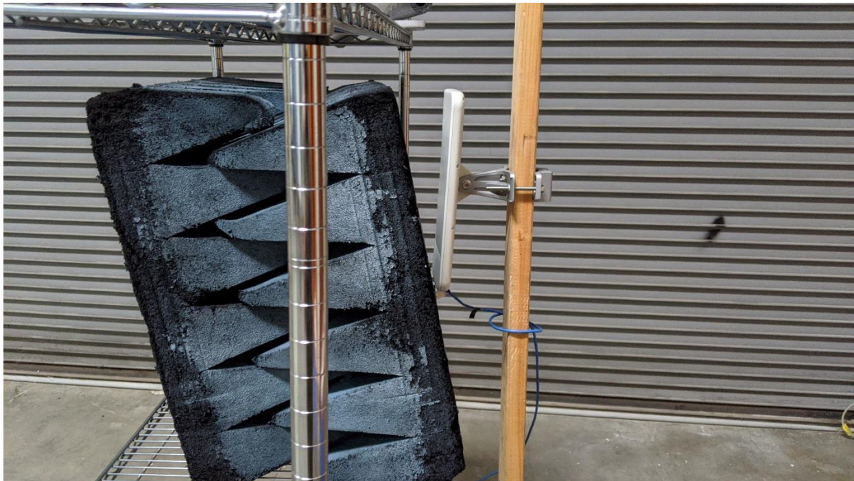
Radiated DFS Client Setup