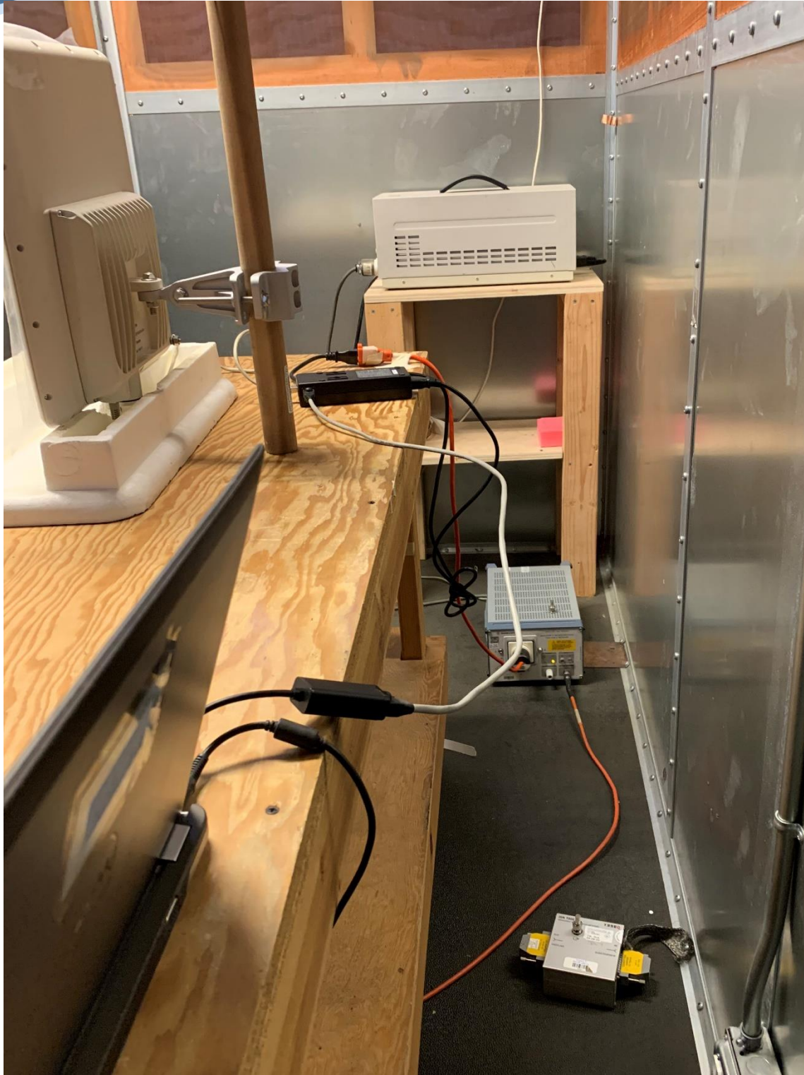
RDWN69 AC Conducted Emissions side view