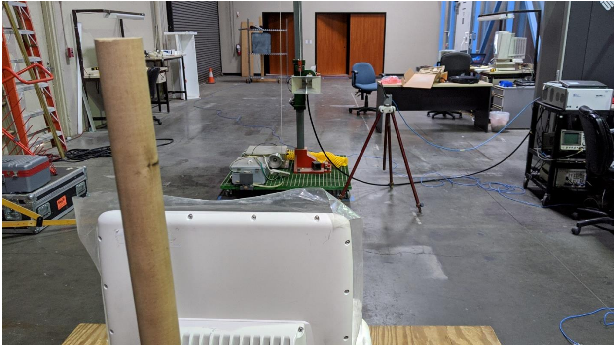
Radiated DFS EUT View