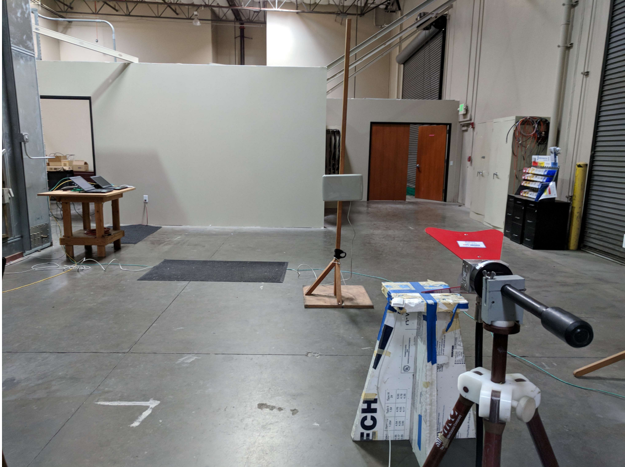
Radiated DFS Setup

This test report may be reproduced in full only. The document may only be updated by MiCOM Labs personnel. All changes will be noted in the Document History section of the report.