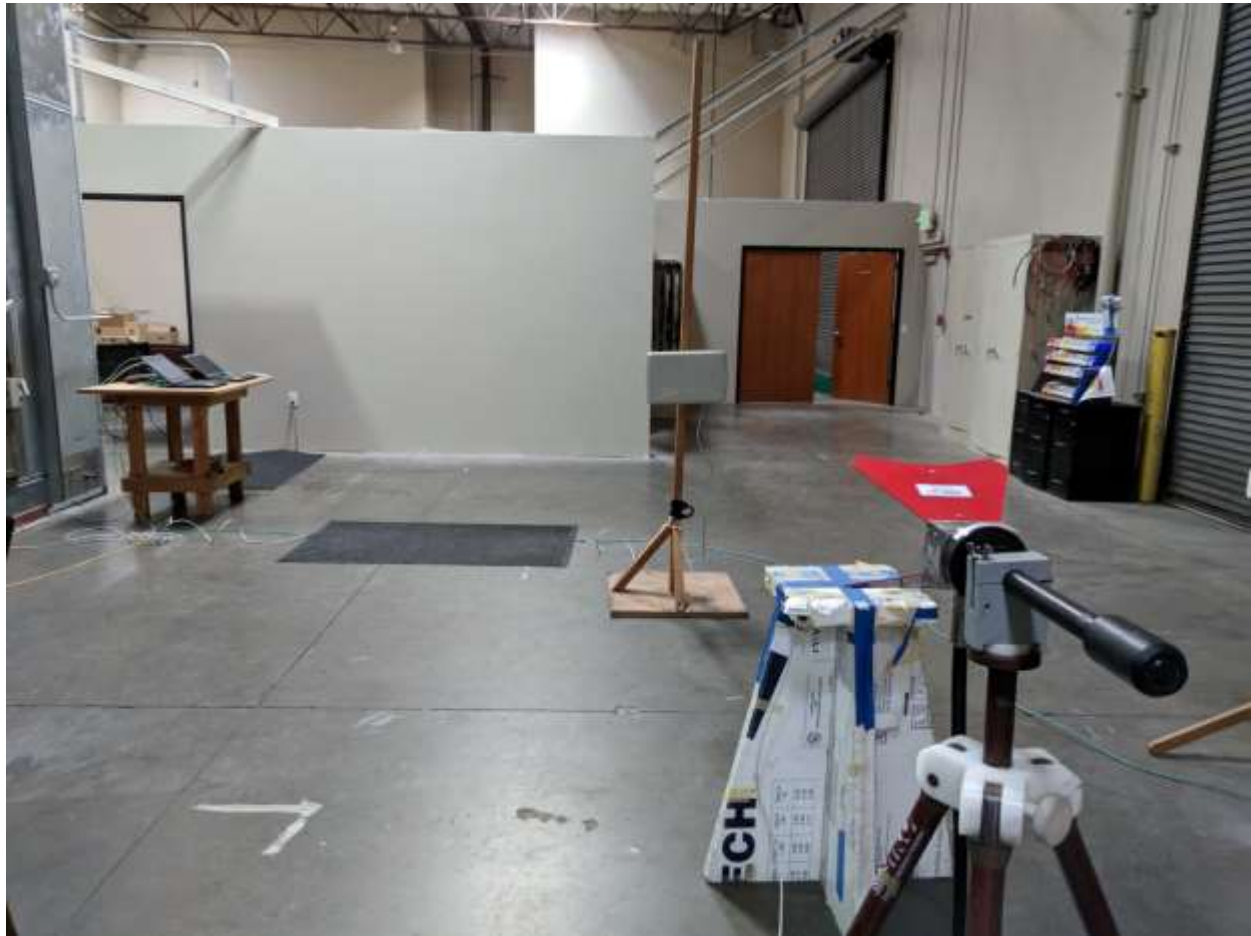
Radiated DFS Setup