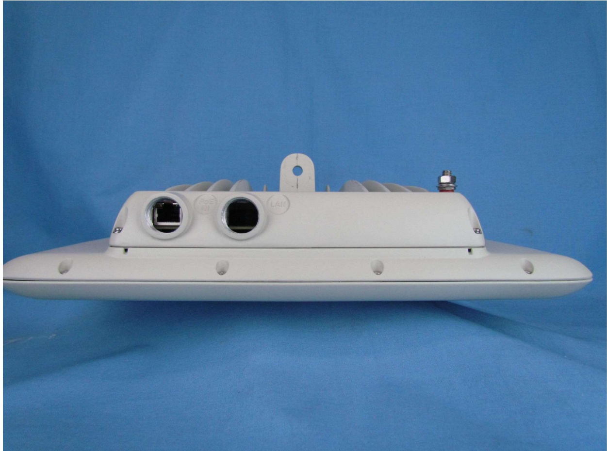
Bottom Side View