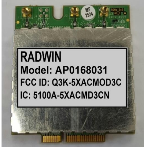
Module with the RF shielding and Label