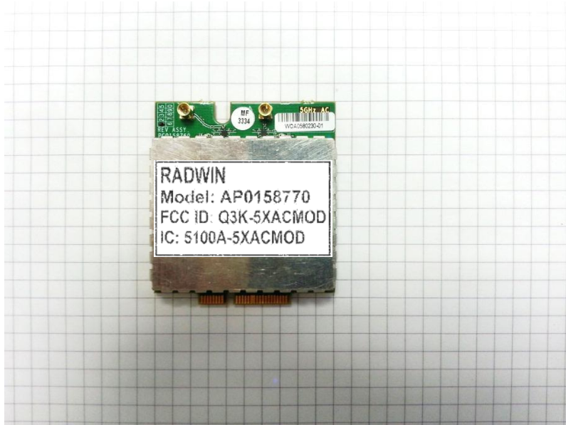
Module with the RF shielding and Label