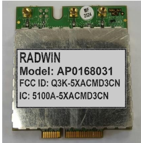
Module with the RF shielding and Label