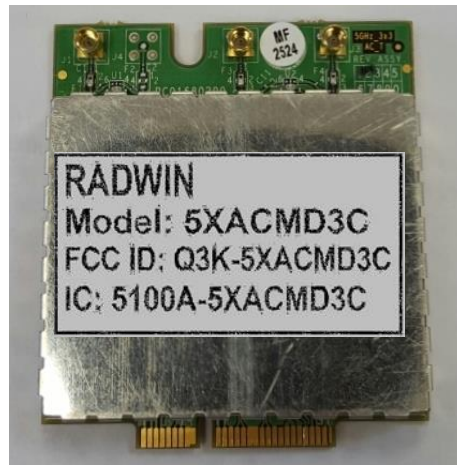
Module with the RF shielding and Label