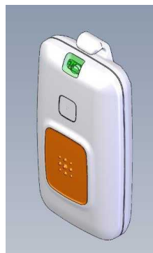
Figure 1: P-1000 Pendant Tag

P-1000 Tags optionally come with a Call Button and an embedded Low frequency (125KHz) Receiver.