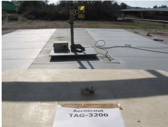
Radiated Emission Test