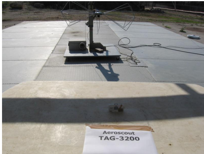
Radiated Emission Test