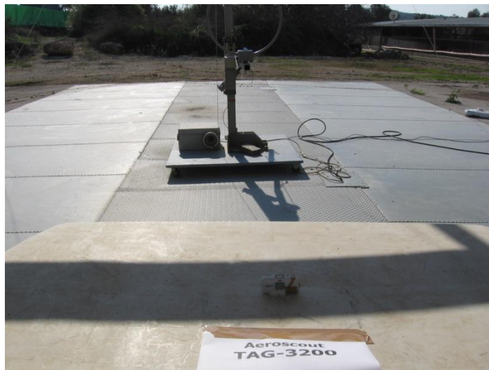
Radiated Emission Test