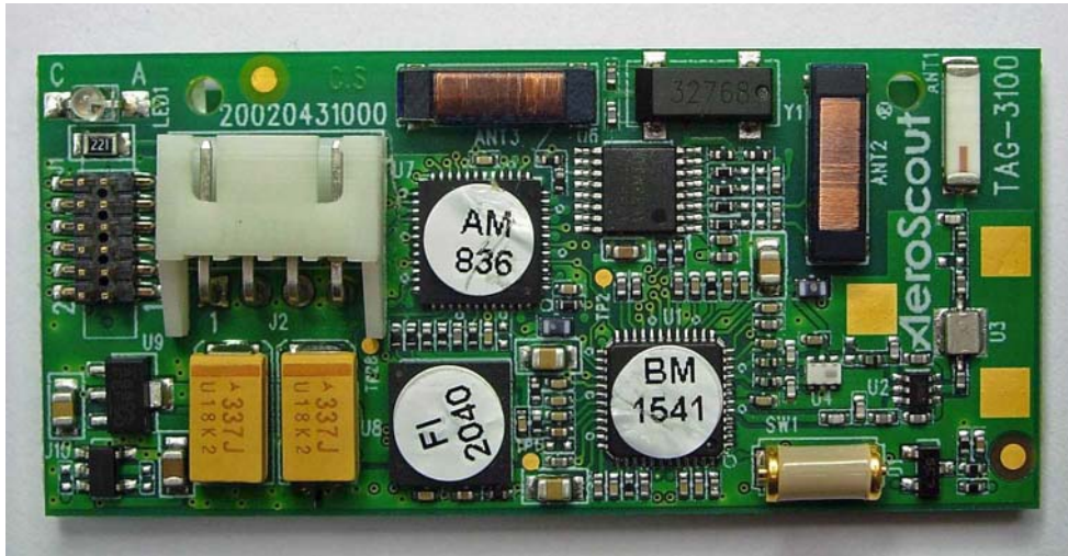
Figure 1 PCB Component Side