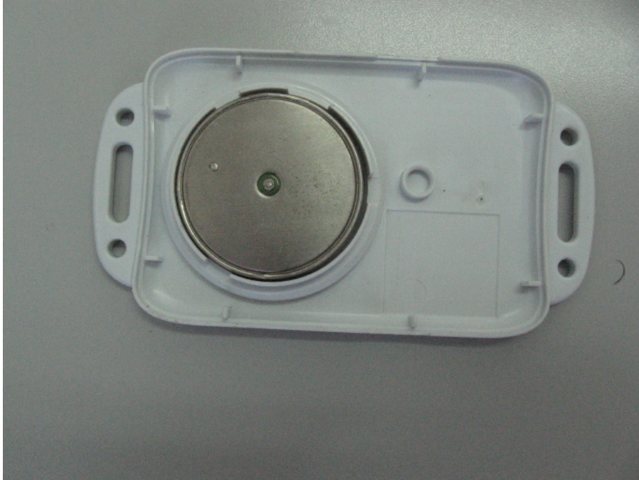
Figure 1 Rear Cover With Battery