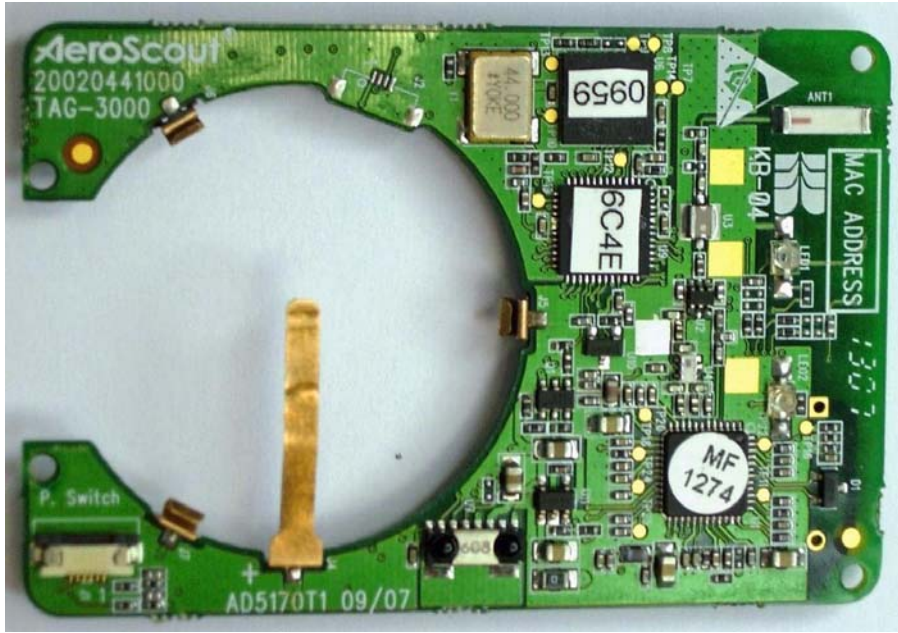
Figure 5 Side 2