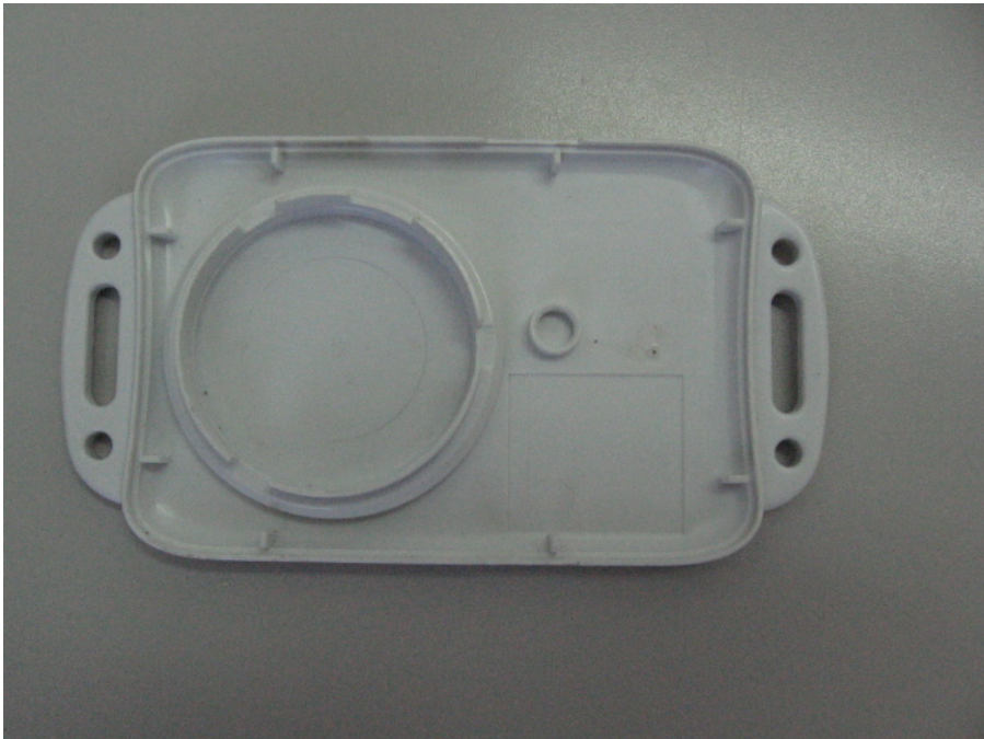
Figure 2 Rear Cover Without Battery