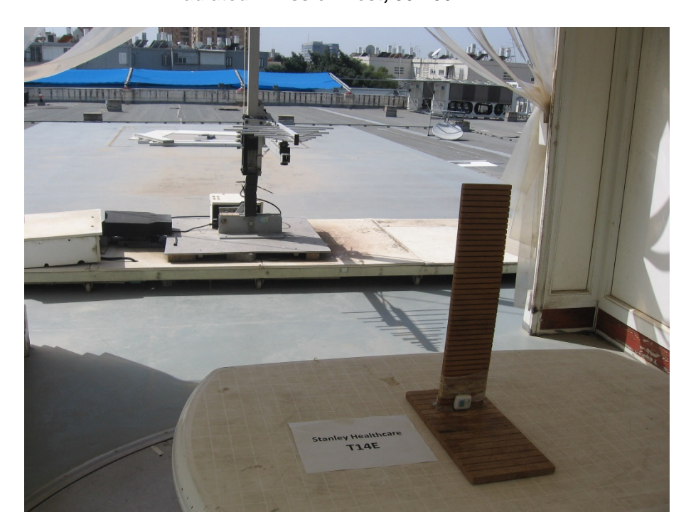
Radiated Emission Test, 200-1000MHz