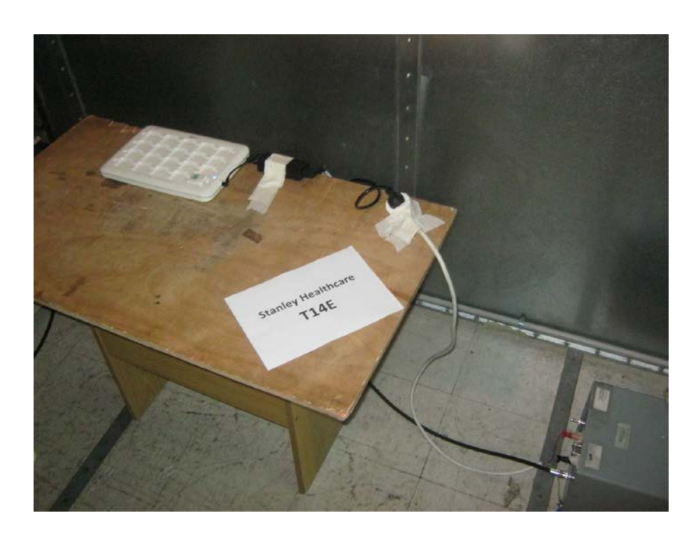
Conducted Emission Test