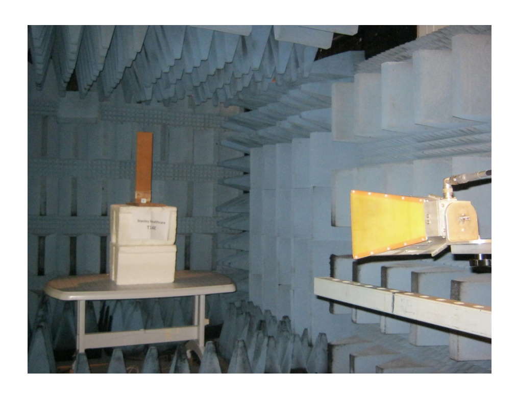
Radiated Emission Test, 1000-18,000MHz