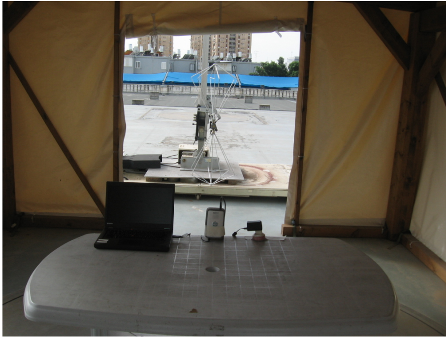
Radiated Emission Test, 30-200MHz