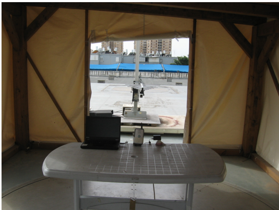
Radiated Emission Test, 200-1000MHz