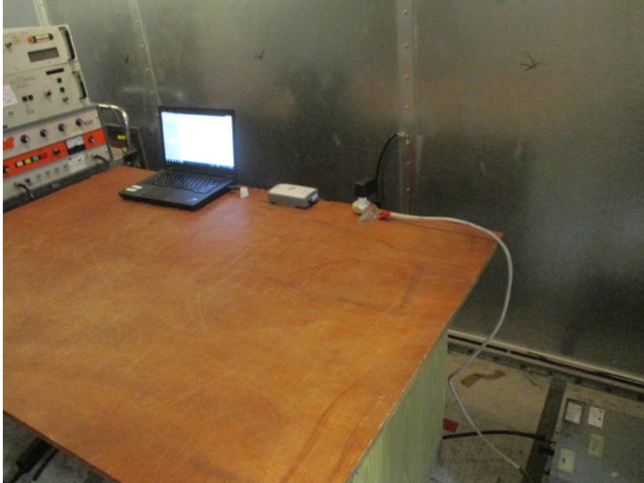
Conducted Emission from AC Line Test