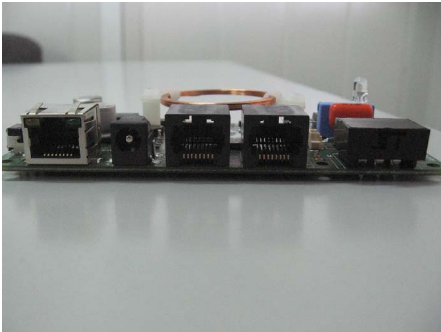
Figure 4 PCB Side Connectors