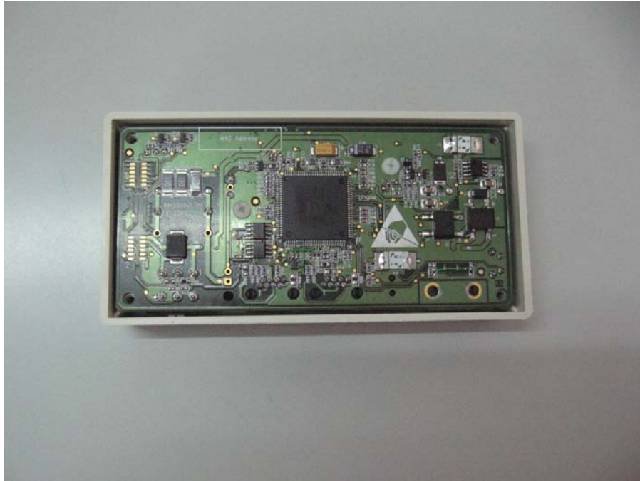
Figure 1 PCB in Cover