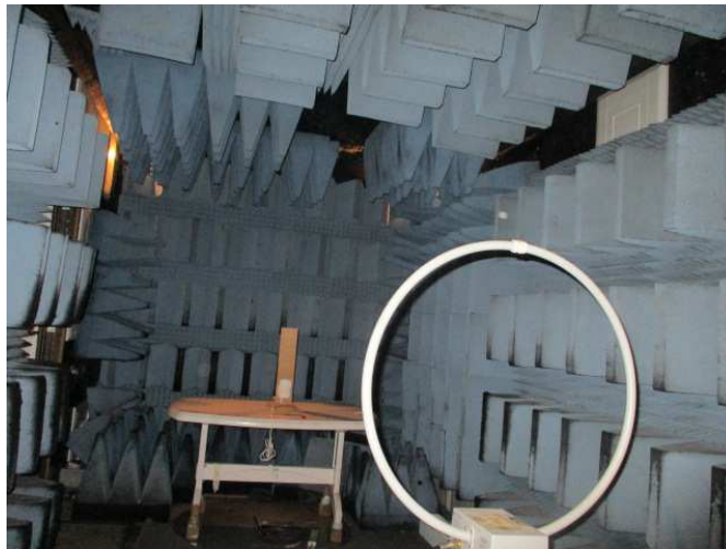
Figure 2. Radiated Emission Test, 0.009 30.0MHz