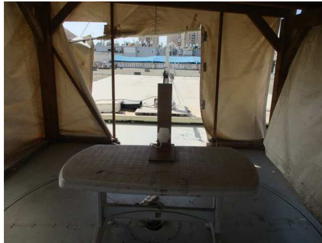
Figure 3. Radiated Emission Test, 30.0-200.0MHz