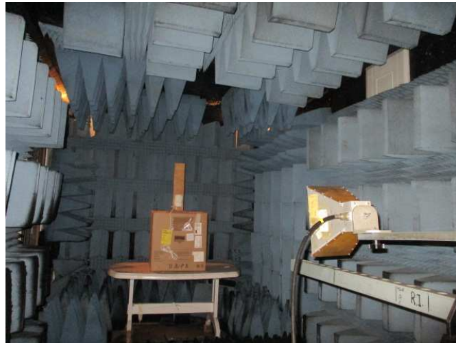
Figure 5. Radiated Emission Test, 1.0-18.0GHz