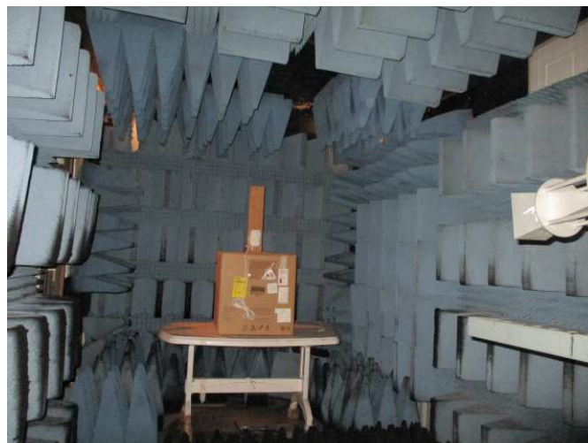
Figure 6. Radiated Emission Test, 18-26.5GHz