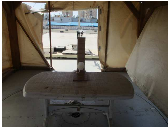
Figure 4. Radiated Emission Test, 200.0-1000.0MHz