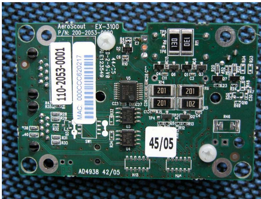
Figure 3 PCB Side 2