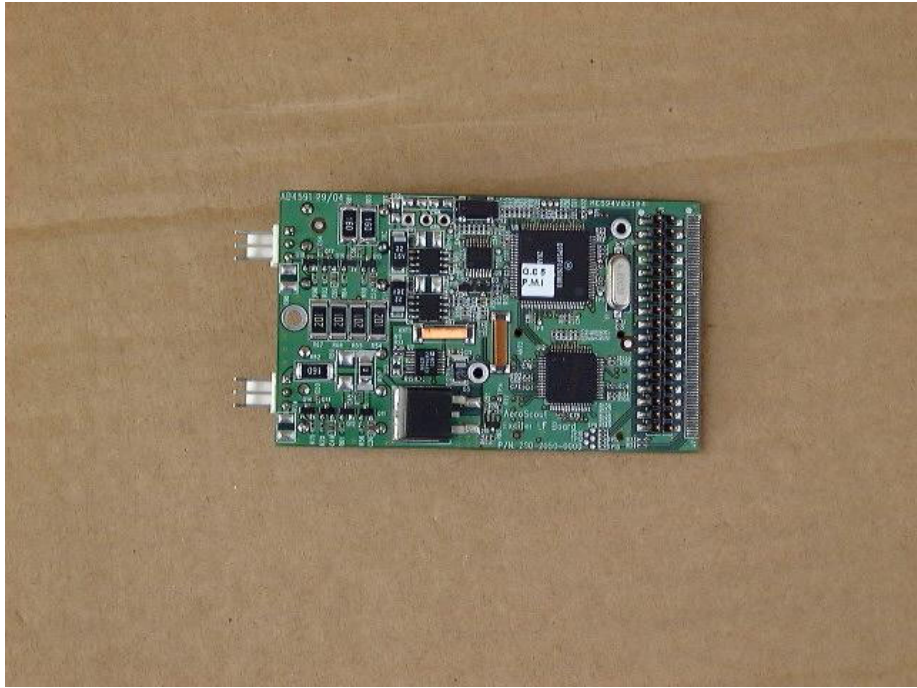
Figure 7 PCB 2 Side 2