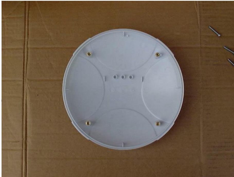
Figure 1 Front Cover Internal View