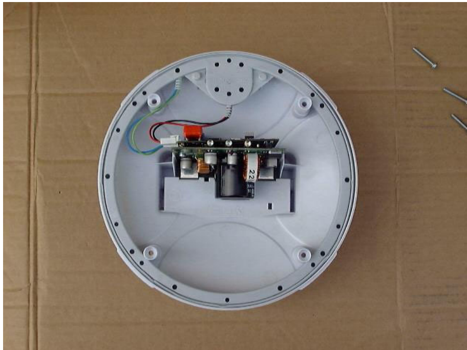
Figure 2 Rear Cover Internal View With Transmitter