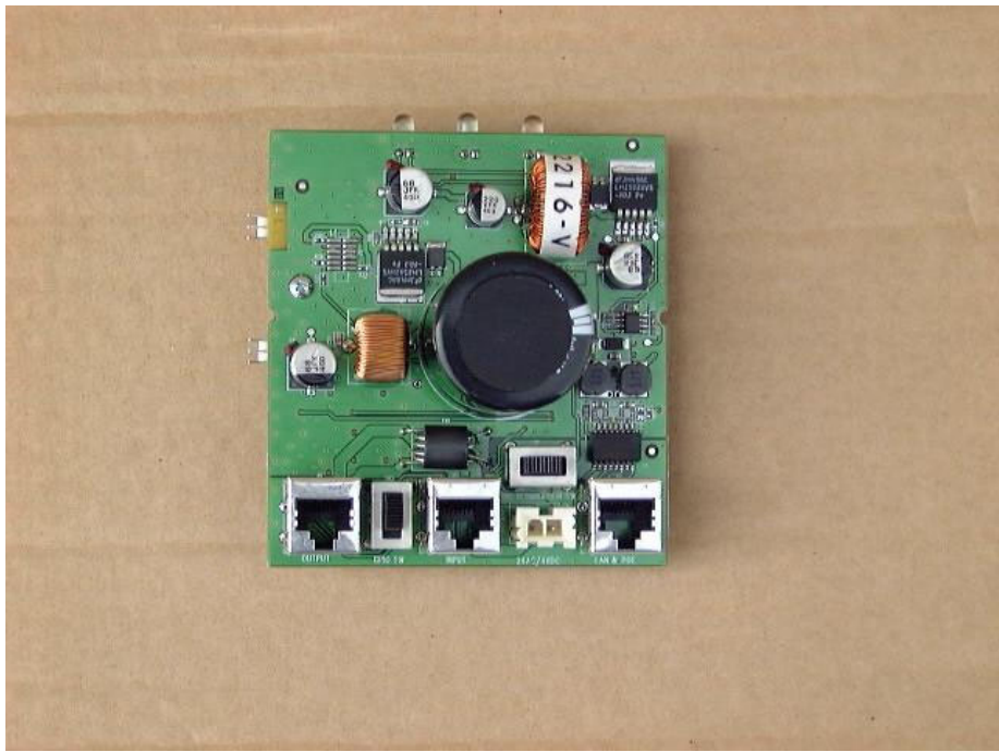
Figure 5 PCB 1 Side 2