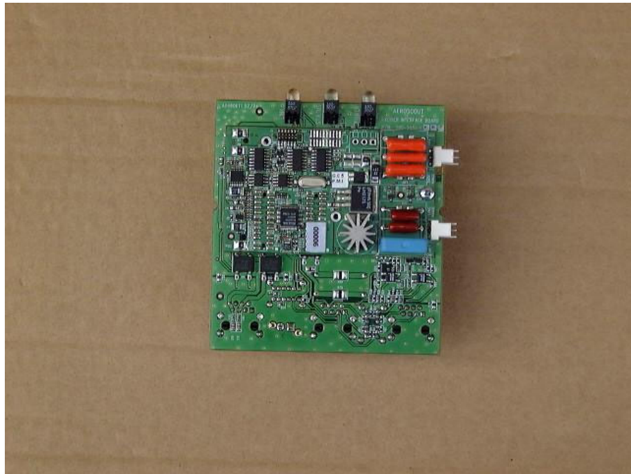
Figure 3 Two PCBs Together