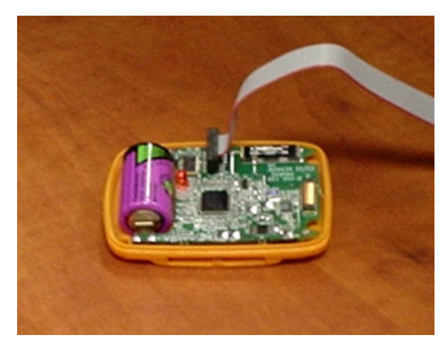
Figure 5: Connecting the RS-232 Cable to the Tag

9. In the RF Parameters section, set the following options for Tag transmissions: