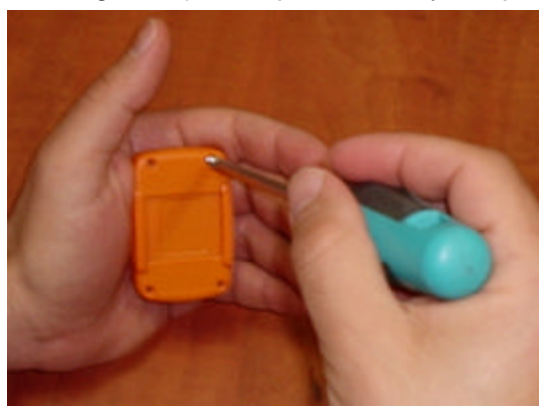
Figure 4: Opening the Tag Case