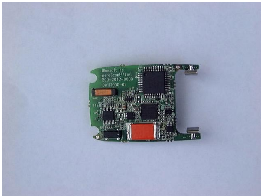
Figure 6 PCB Side 1 Without Battery