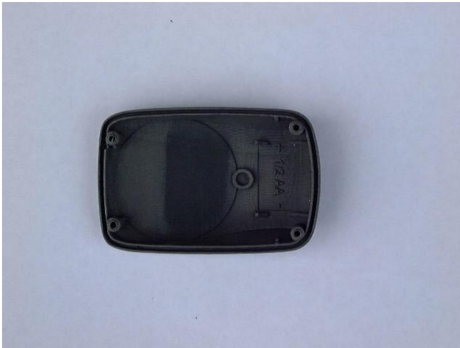
Figure 1 Top Cover Internal View