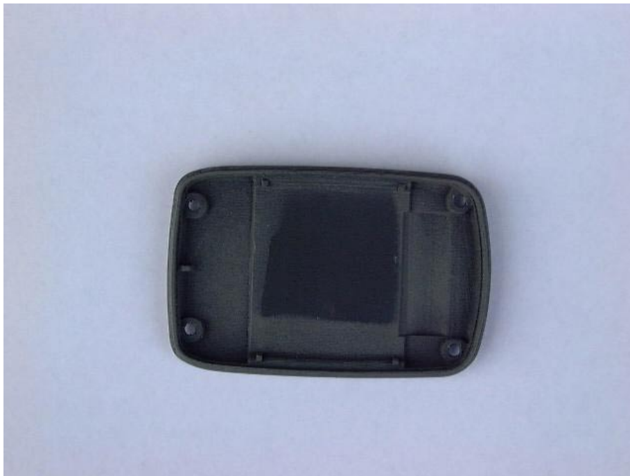
Figure 2 Bottom Cover Internal View