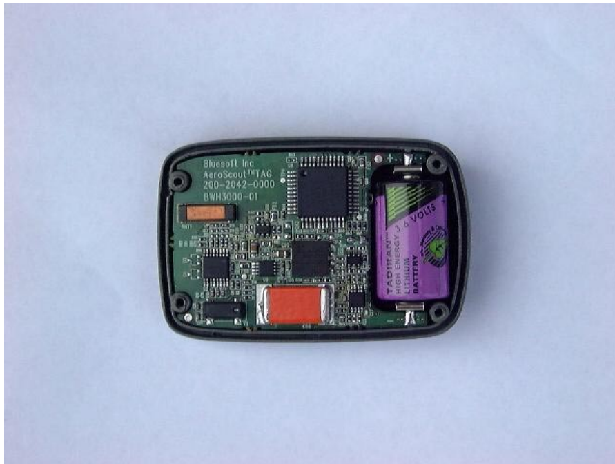
Figure 3 PCB in Case