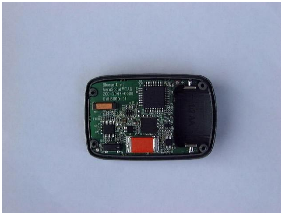
Figure 4 PCB in Case Without Battery