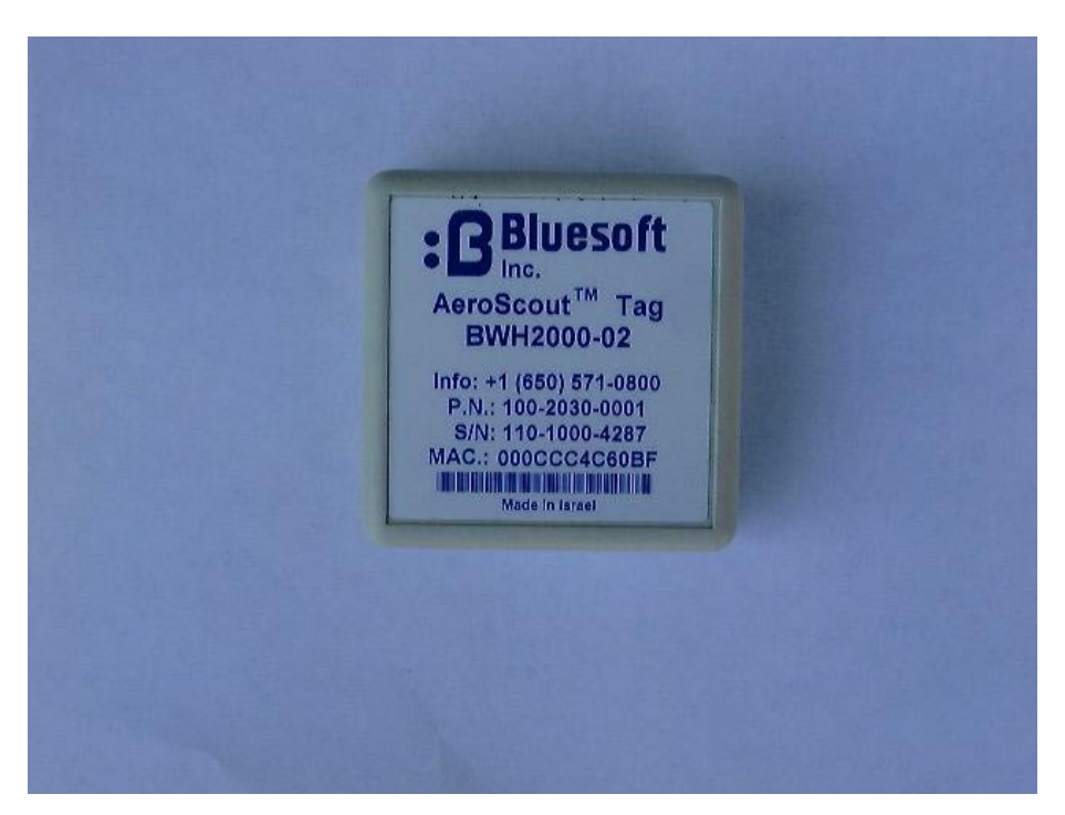
Figure 1 Top View External