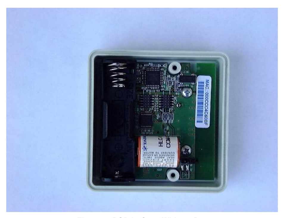
Figure 4 PCB in Case Without Battery