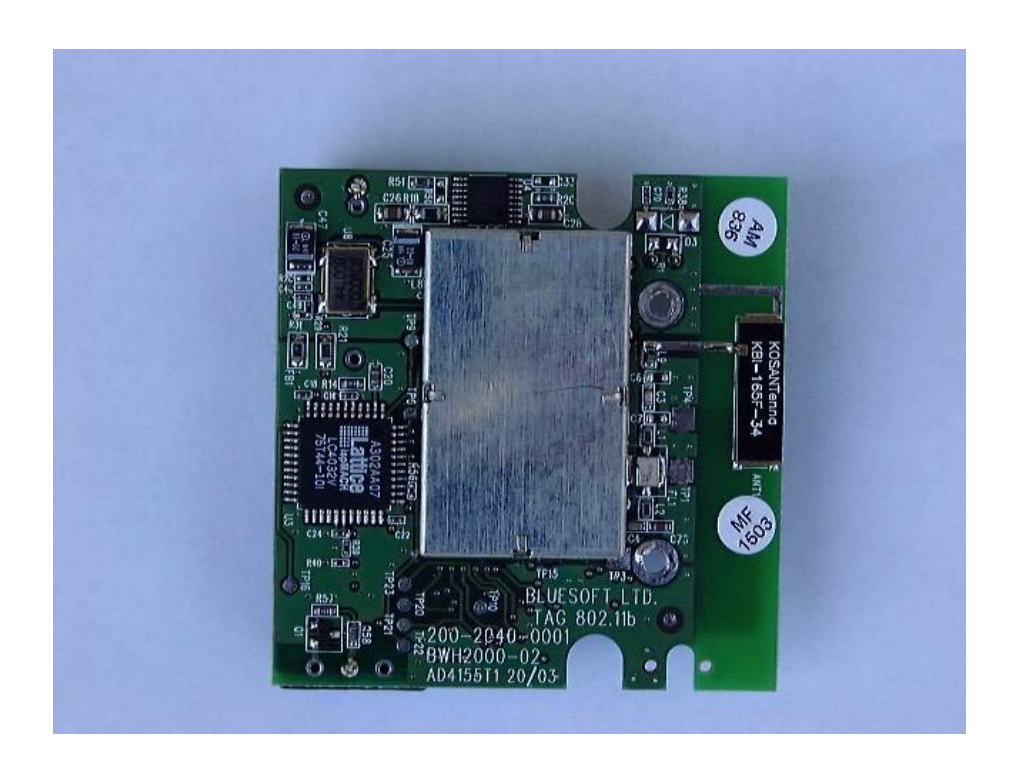
Figure 6 PCB Side 2