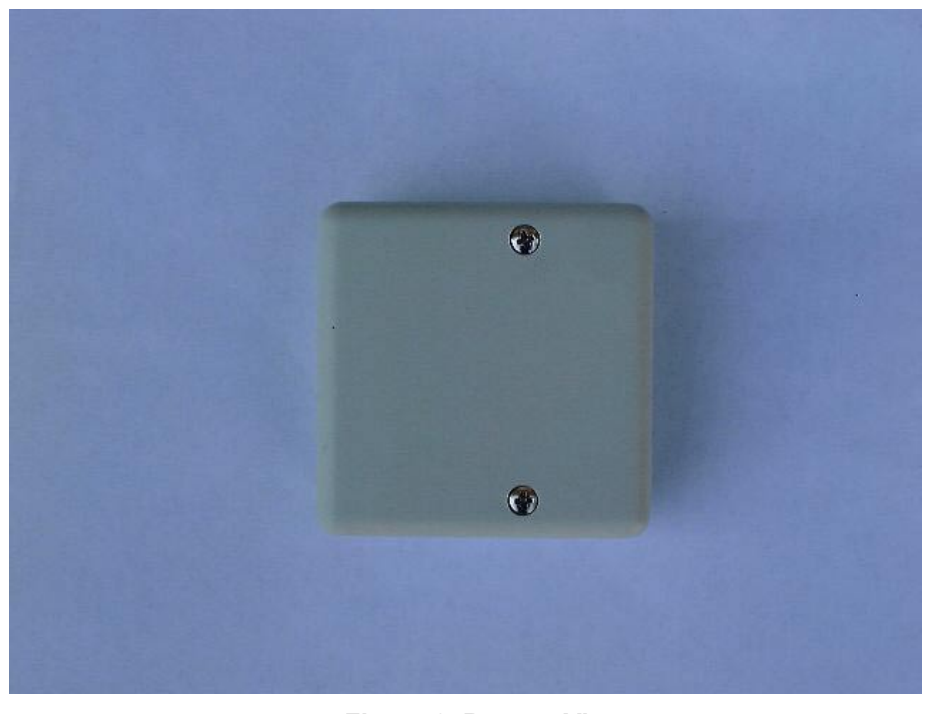
Figure 2 Bottom View