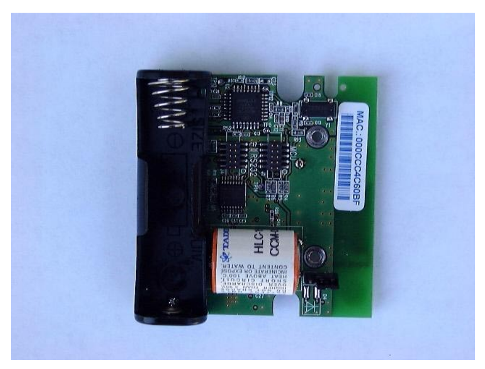
Figure 5 PCB Side 1