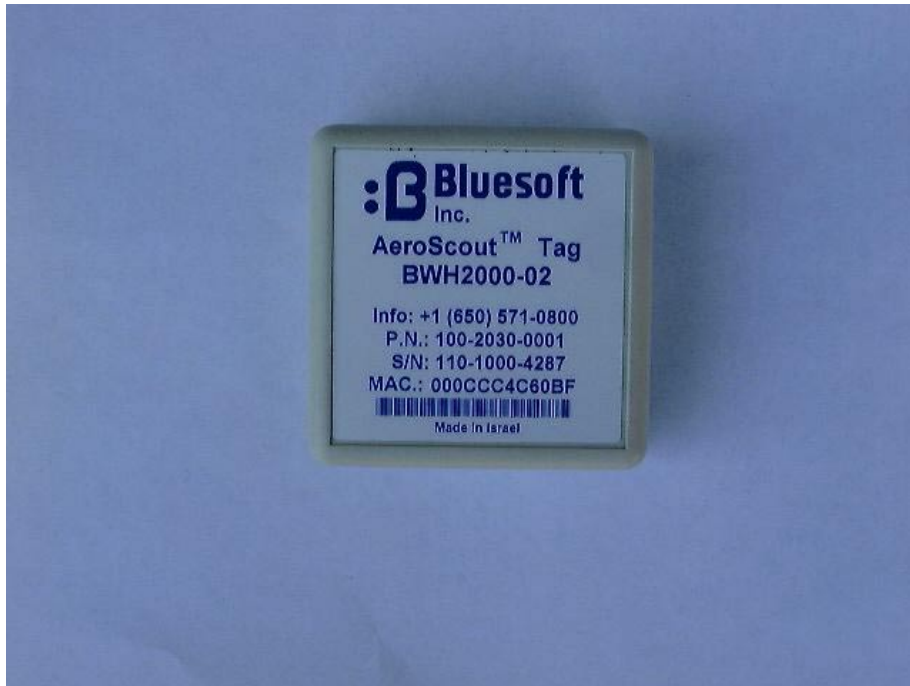
Figure 1 Top View External