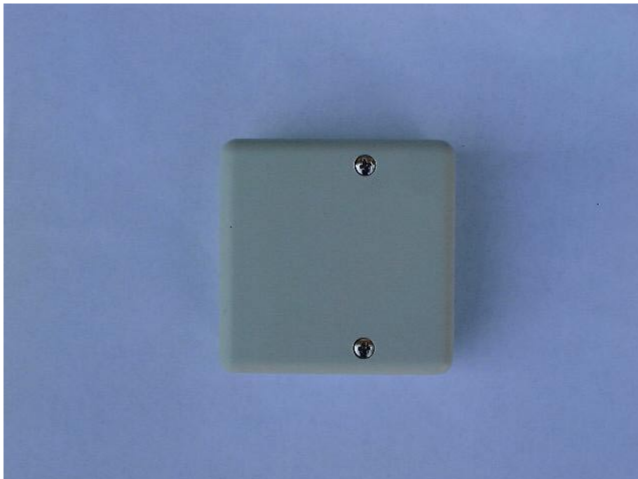
Figure 2 Bottom View