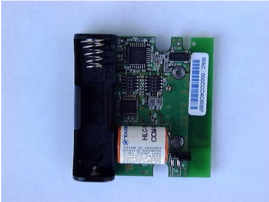
Figure 5 PCB Side 1