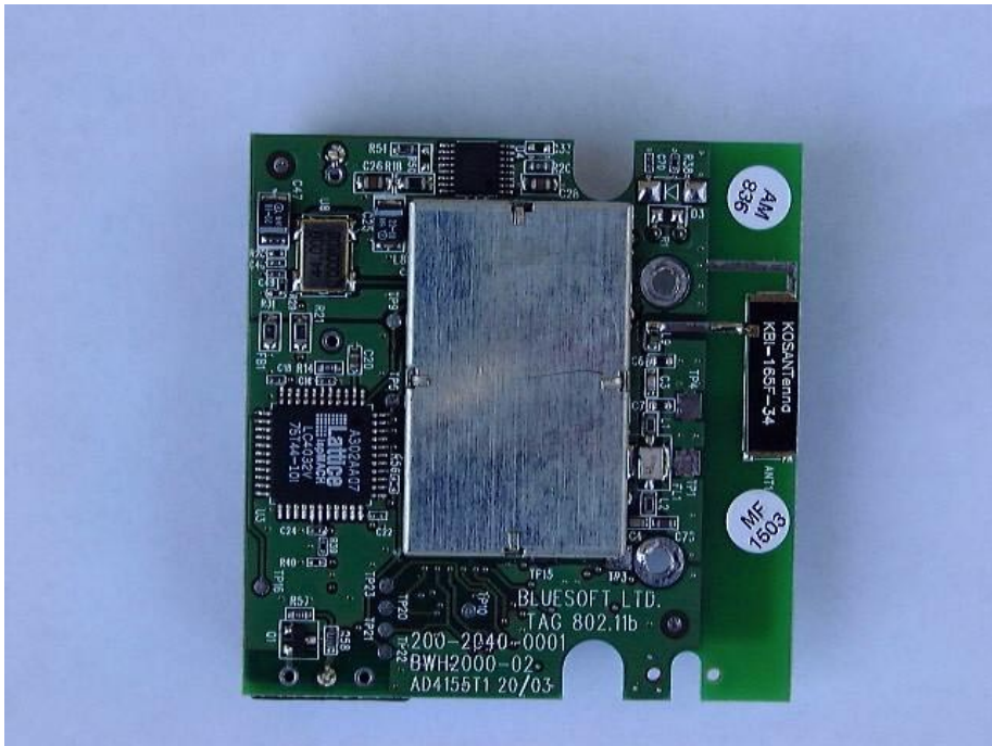
Figure 6 PCB Side 2