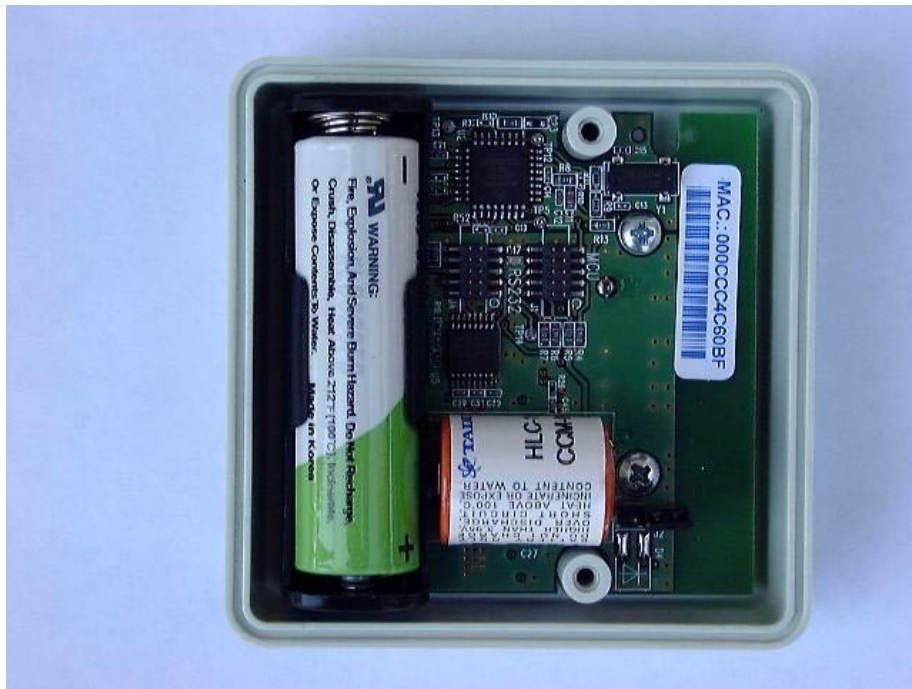
Figure 3 PCB in Case