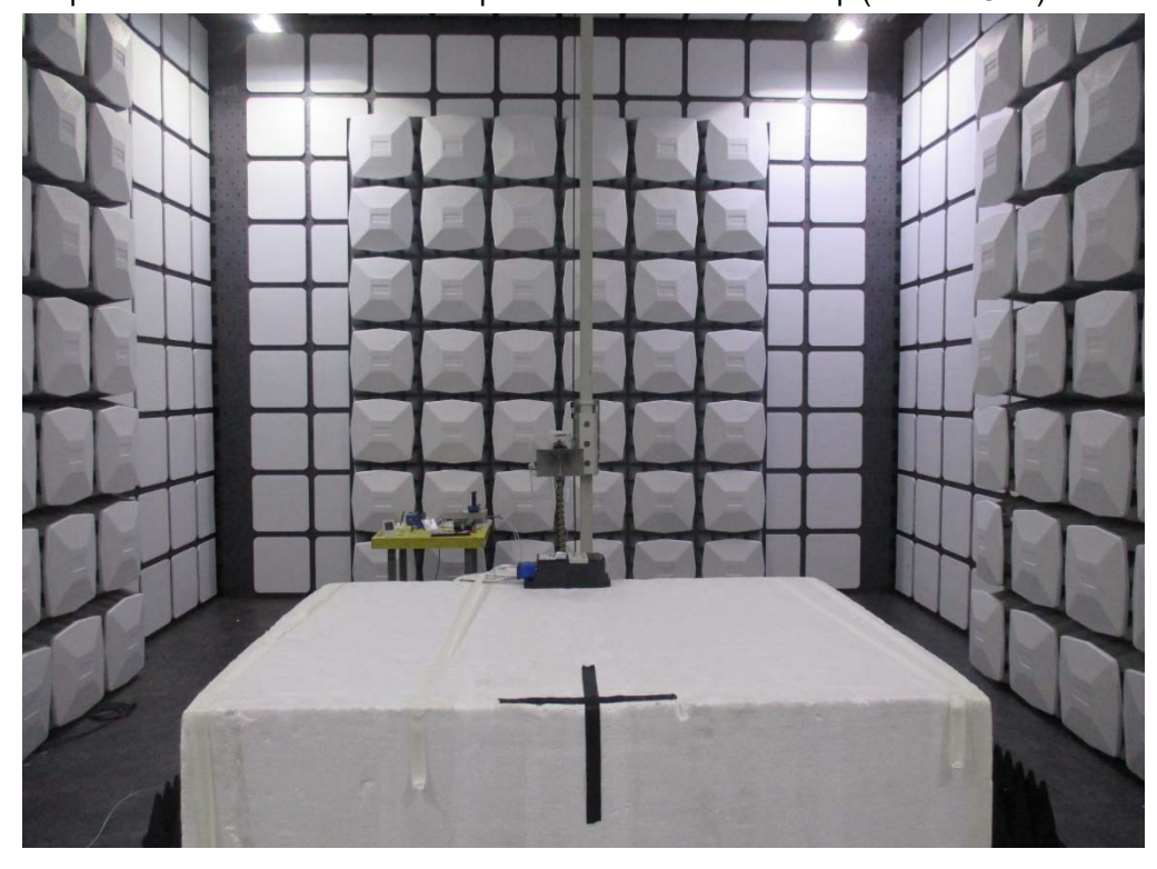
Description: Back View of Radiated Spurious Emission Test Setup (above 1GHz)