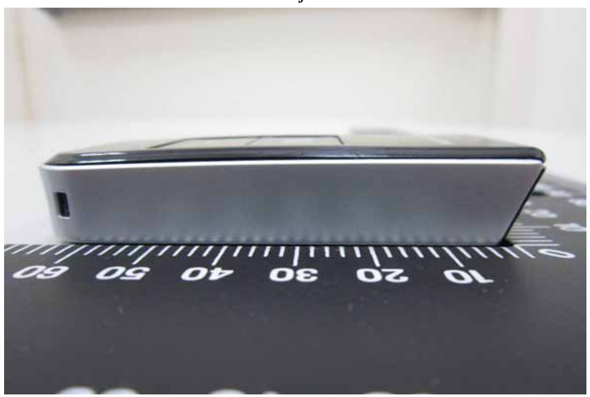
Side View of EUT - 3