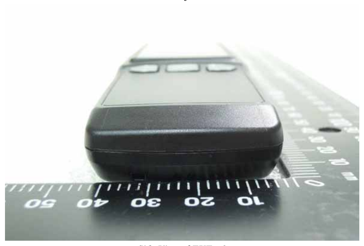
Side View of EUT - 2