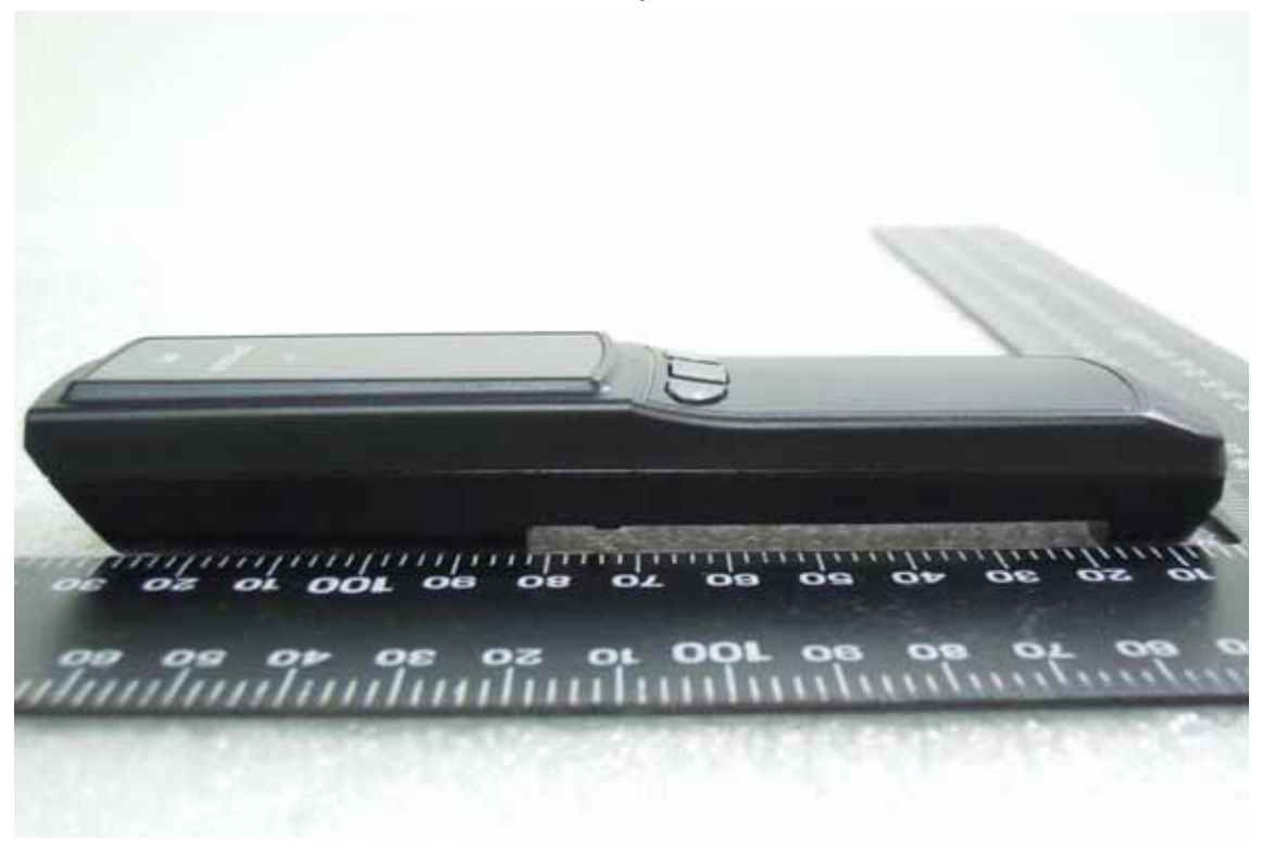
~ End of Report ~

Unless otherwise stated the results shown in this test report refer only to the sample(s) tested and such sample(s) are retained for 90 days only. 除非另有說明,此報告結果僅對測試之樣品負責,同時此樣品僅保留90天。本報告未經本公司書面許可,不可部份複製。 This document is issued by the Company subject to its General Conditions of Service printed overleaf, available on request or accessible at <a href="https://www.sgs.com/terms">www.sgs.com/terms</a> and conditions.htm and, for electronic format documents, subject to Terms and Conditions for Electronic Documents at <a href="https://www.sgs.com/terms">www.sgs.com/terms</a> e-document.htm. Attention is drawn to the limitation of liability, indemnification and jurisdiction issues defined therein. Any holder of this document is advised that information contained hereon reflects the Company's findings at the time of its intervention only and within the limits of Client's instructions, if any. The Company's sole responsibility is to its Client and this document does not exonerate parties to a transaction from exercising all their rights and obligations under the transaction documents. This document cannot be reproduced except in full, without prior written approval of the Company. Any unauthorized alteration, forgery or falsification of the content or apparate is unleaded and the processor of this document is unleaded and the processor of this document is unleaded and the processor. pearance of this document is unlawful and offenders may be prosecuted to the fullest extent of the law.