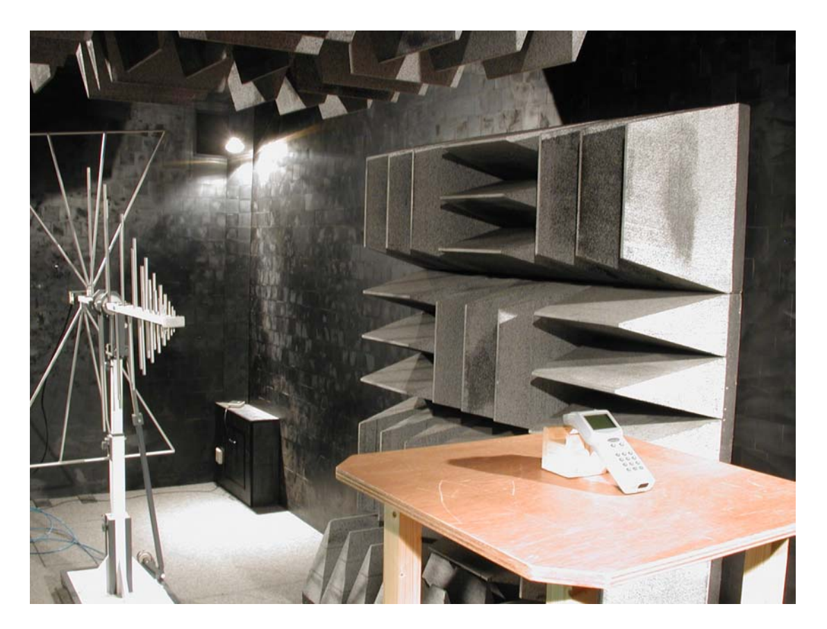
Radiated emission - pre-compliance measurement (ANEC)