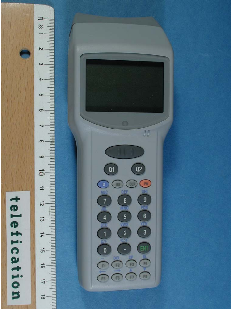
Photograph 1: General view