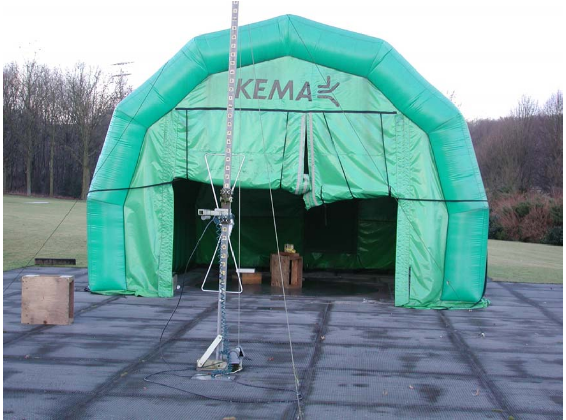
Radiated emission (OATS)