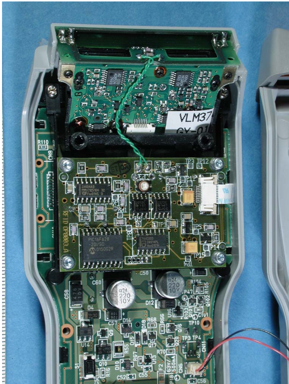
Close view of pc-board