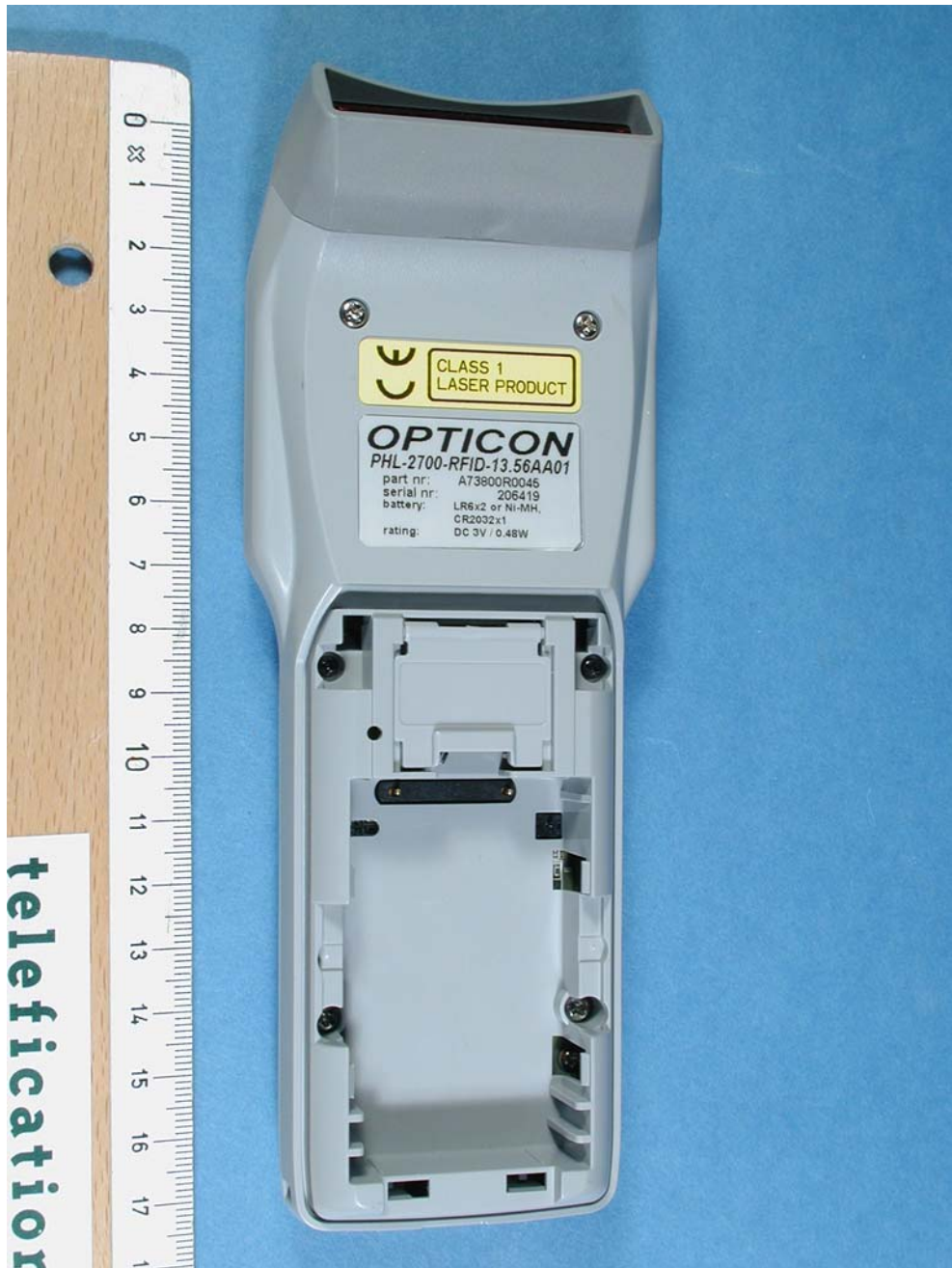
Rear view of equipment with battery and battery cover removed