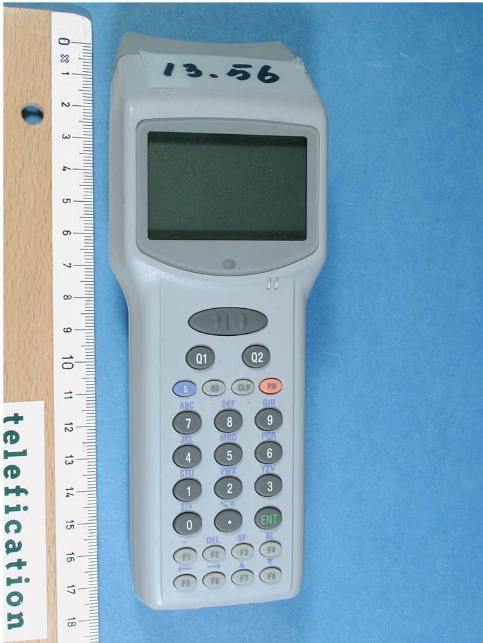
Front view of equipment