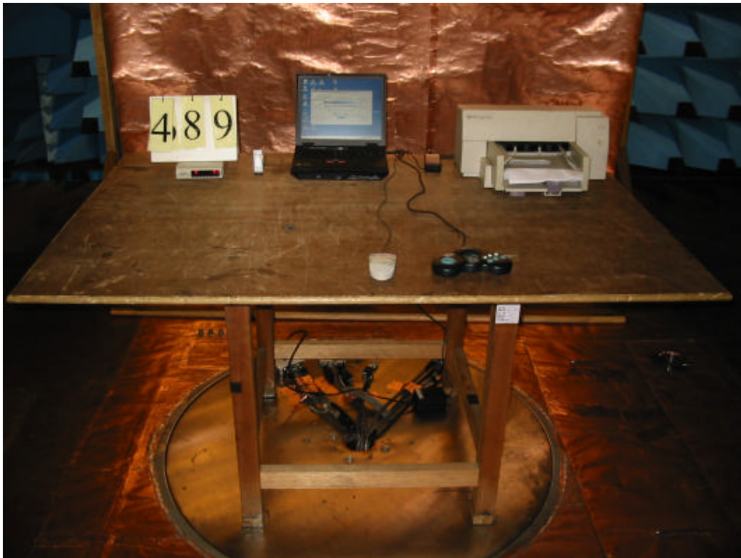
Front View of the Test Configuration