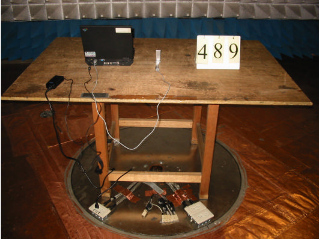
Rear View of Intentional