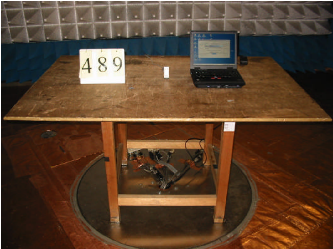
Front View of Intentional