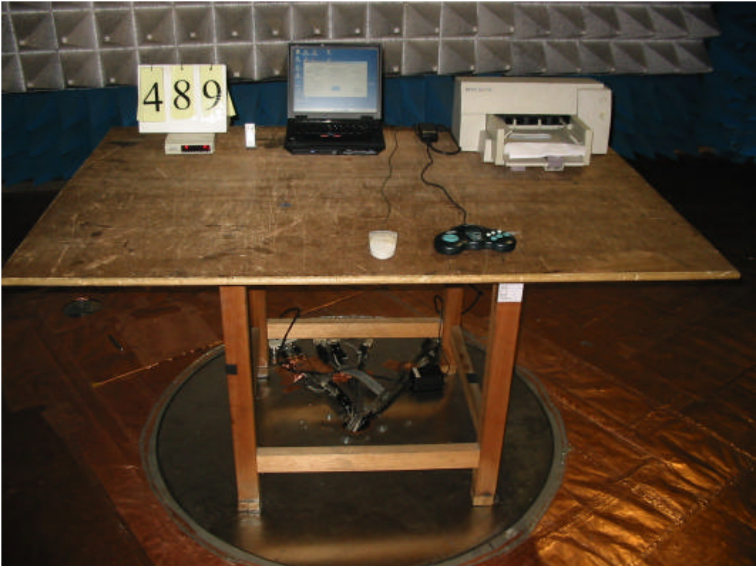
Front View of Unintentional