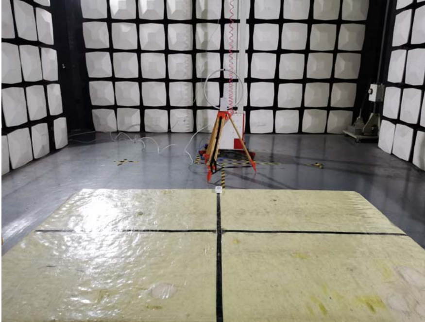
Test Photo Radiated emission (Below 30MHz)