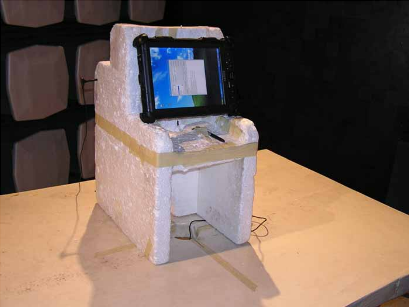
RADIATED EMISSIONS FRONT