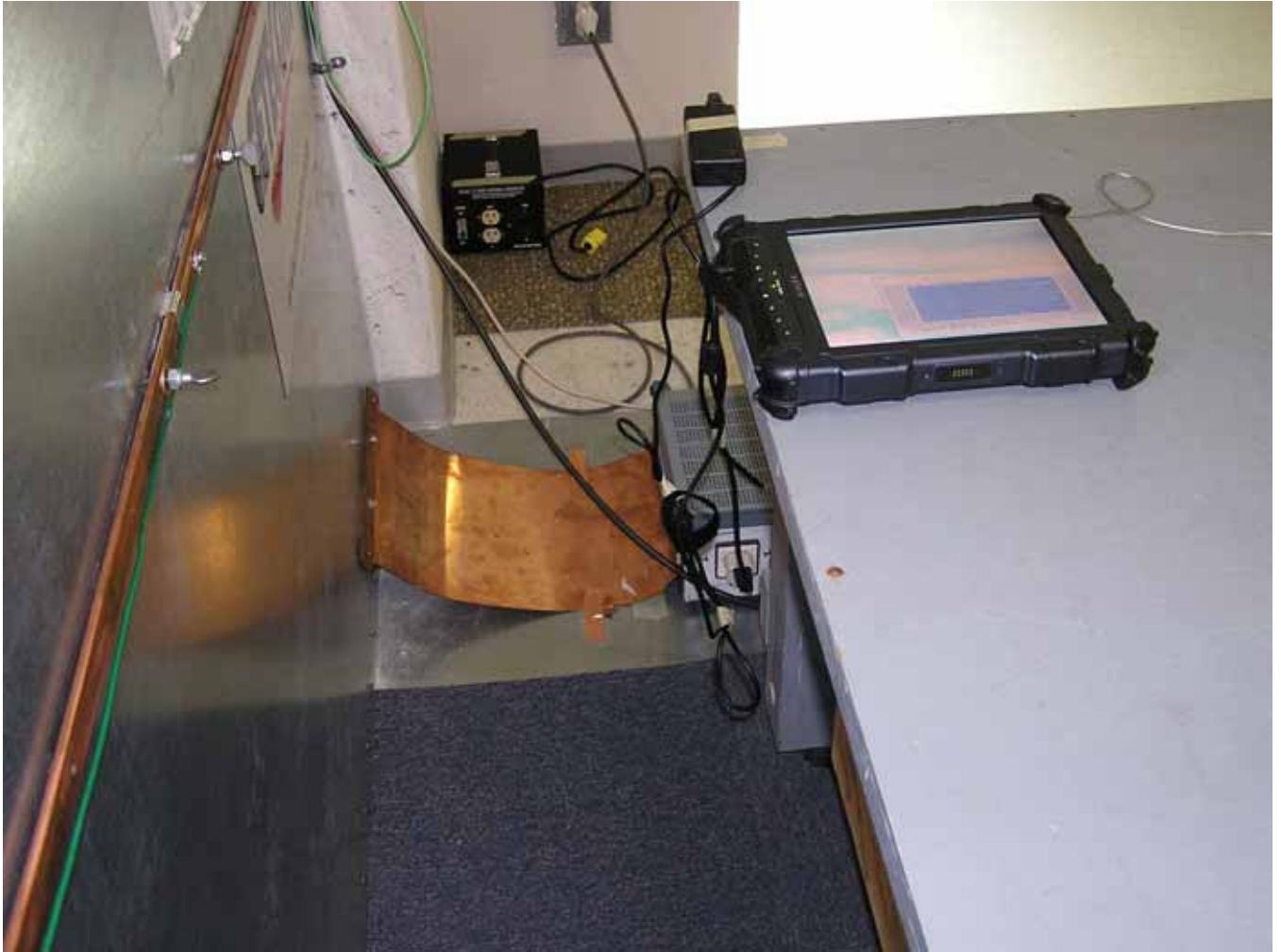
AC LINE CONDUCTION BACK