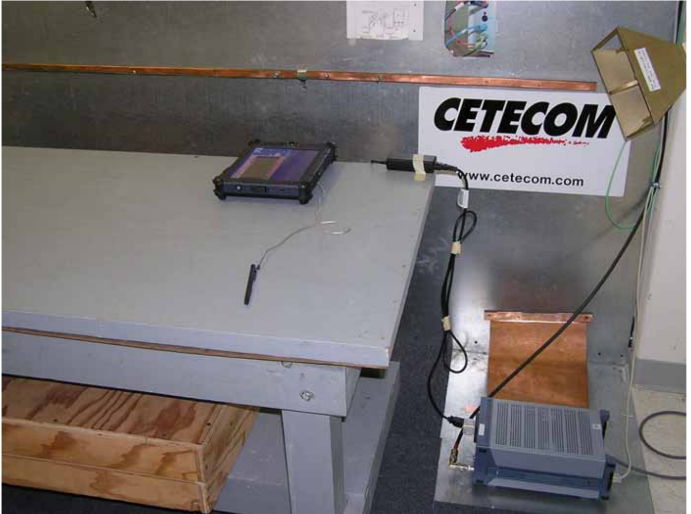
AC LINE CONDUCTION FRONT