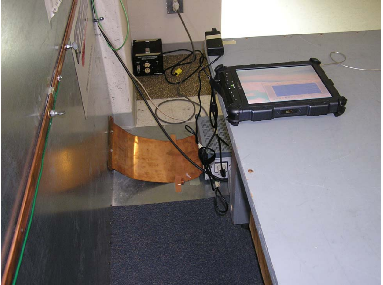
AC LINE CONDUCTION