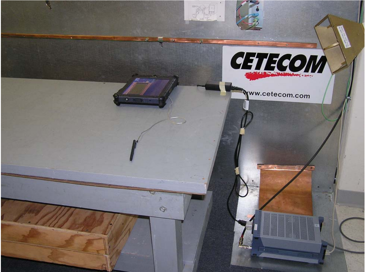
AC LINE CONDUCTION