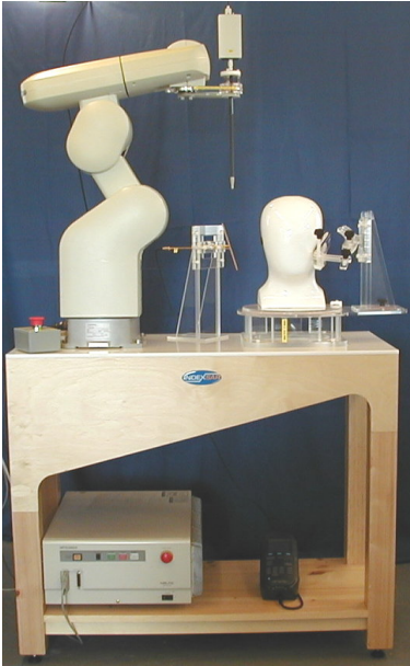
Figure 6: Principal components of the SAR measurement test bench

The major components of the test bench are shown in the picture above. A test set and dipole antenna control the handset via an air link and a low-mass phone holder can position the phone at either ear. Graduated scales are provided to set the phone in the 15 degree position. The upright phantom head holds approx. 7 litres of simulant liquid. The phantom is filled and emptied through a 45mm diameter penetration hole in the top of the head.