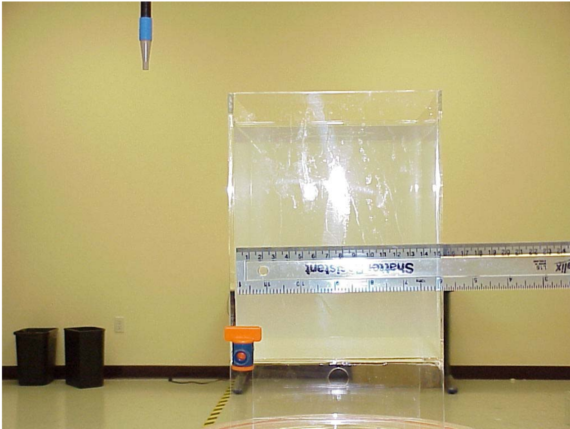
Photo 5 Photo to demonstrate 15 cm Z-axis flat phantom