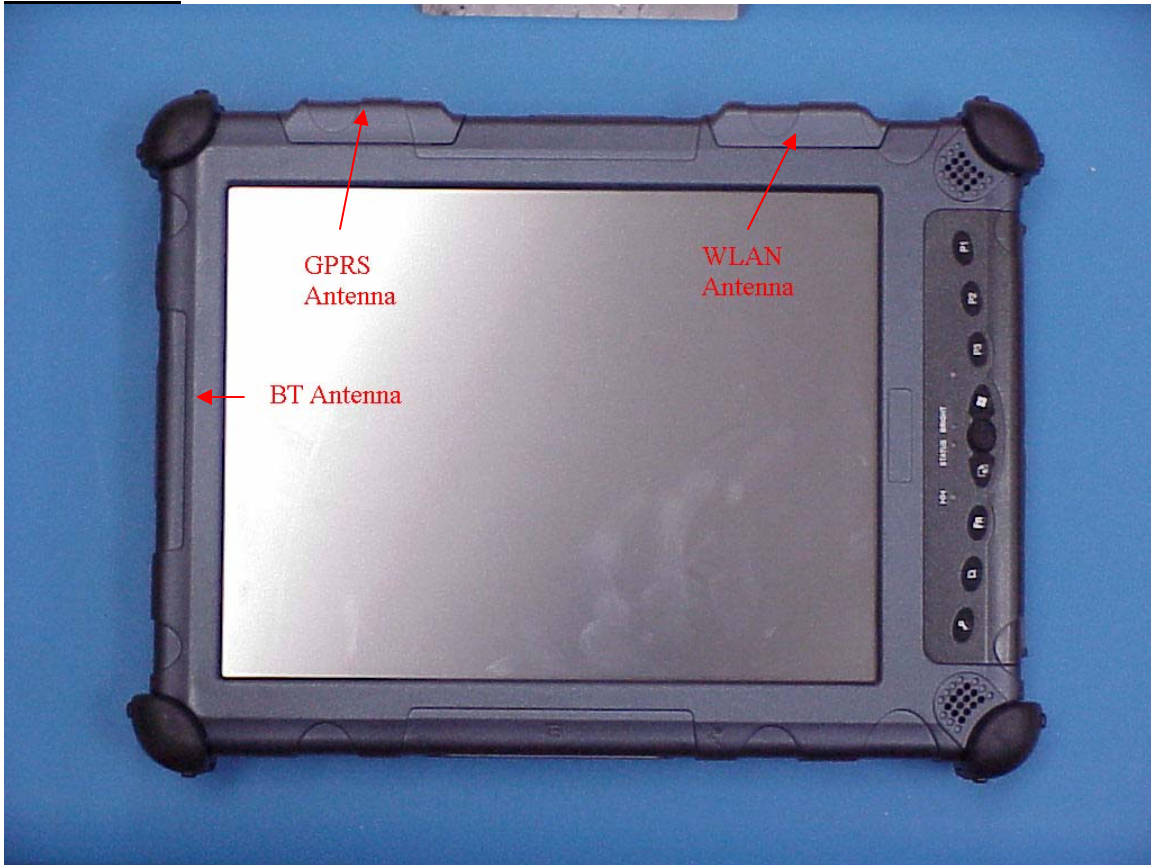
Photo 1. Antenna locations

Please note: all three antennas are installed in the device even if the corresponding radio module is not installed.