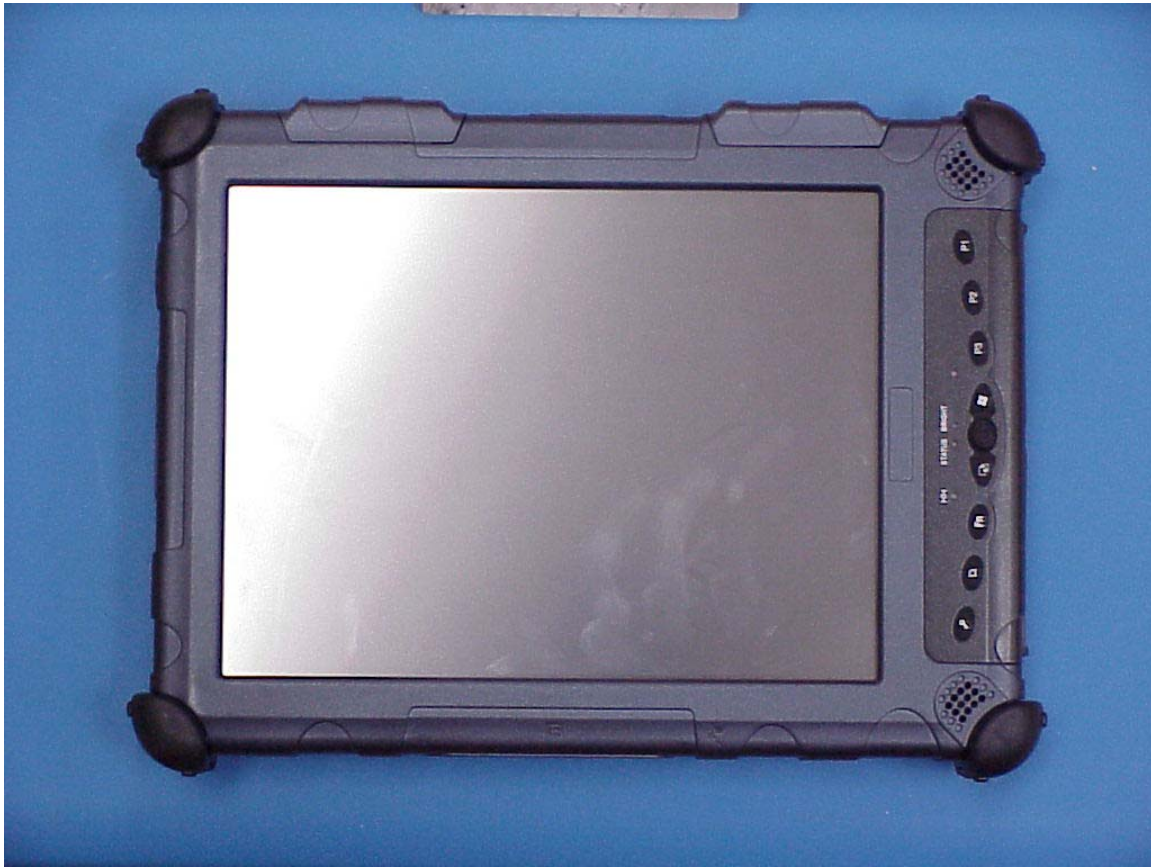
Photo 2. EUT front