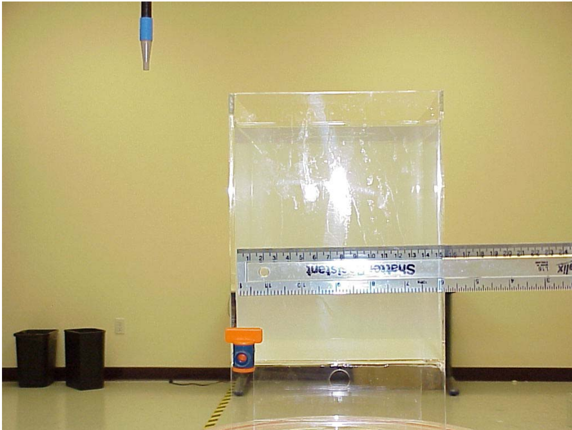
Photo 5 Photo to demonstrate 15 cm Z-axis flat phantom