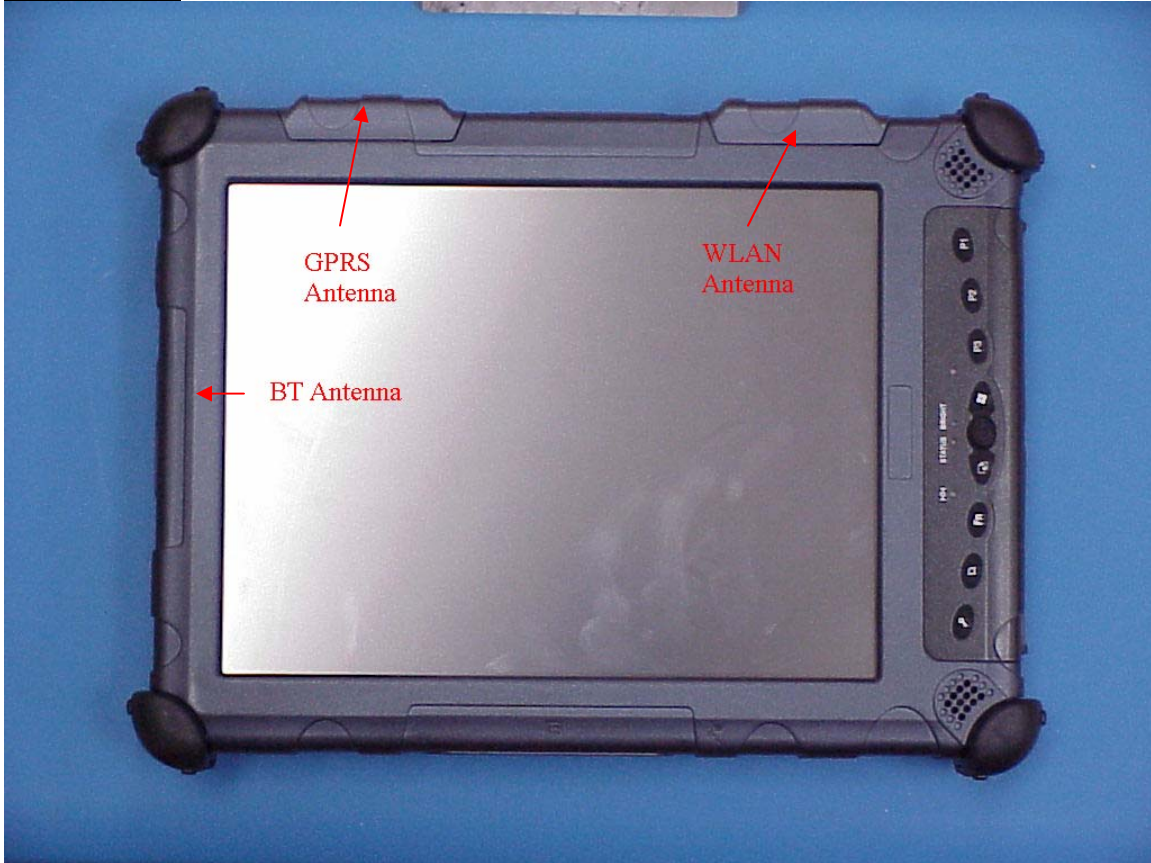
Photo 1. Antenna locations

Please note: all three antennas are installed in the device even if the corresponding radio module is not installed.