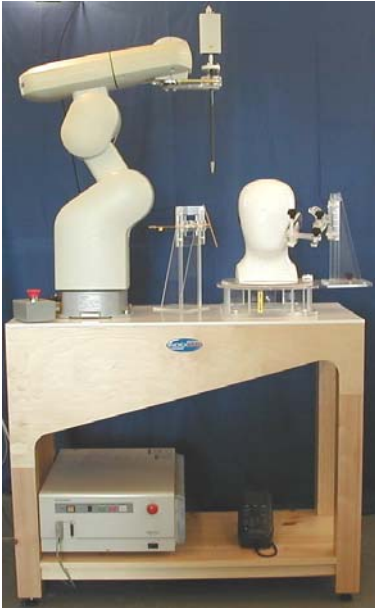
Figure 6: Principal components of the SAR measurement test bench

The major components of the test bench are shown in the picture above. A test set and dipole antenna control the handset via an air link and a low-mass phone holder can position the phone at either ear. Graduated scales are provided to set the phone in the 15 degree position. The upright phantom head holds approx. 7 litres of simulant liquid. The phantom is filled and emptied through a 45mm diameter penetration hole in the top of the head.