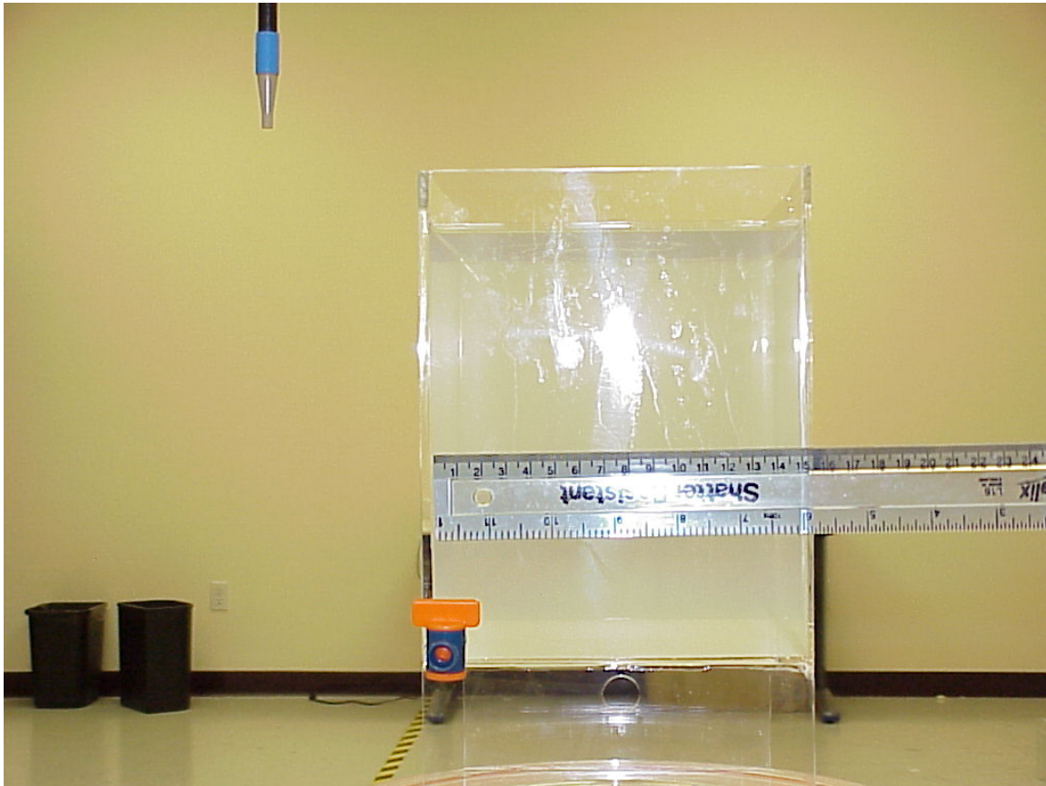
Photo 5. Photo to demonstrate 15 cm Z-axis flat phantom