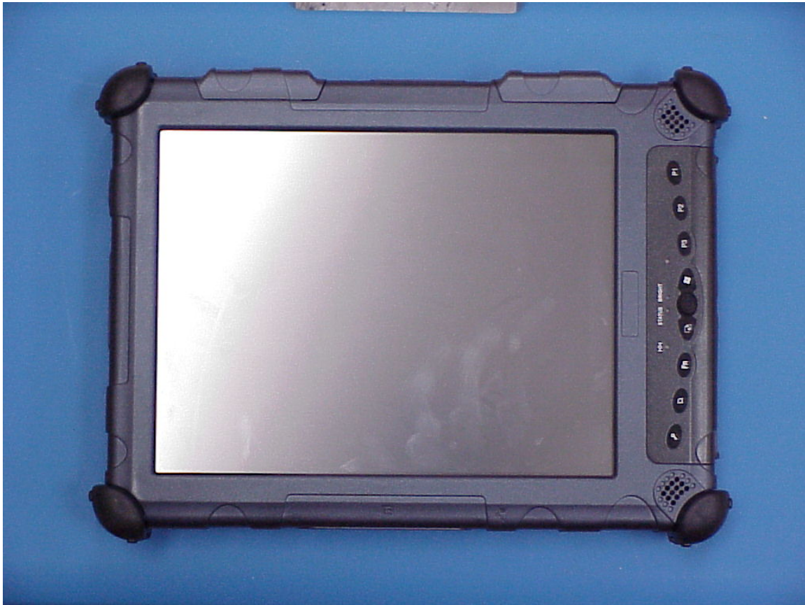
Photo 2. EUT front