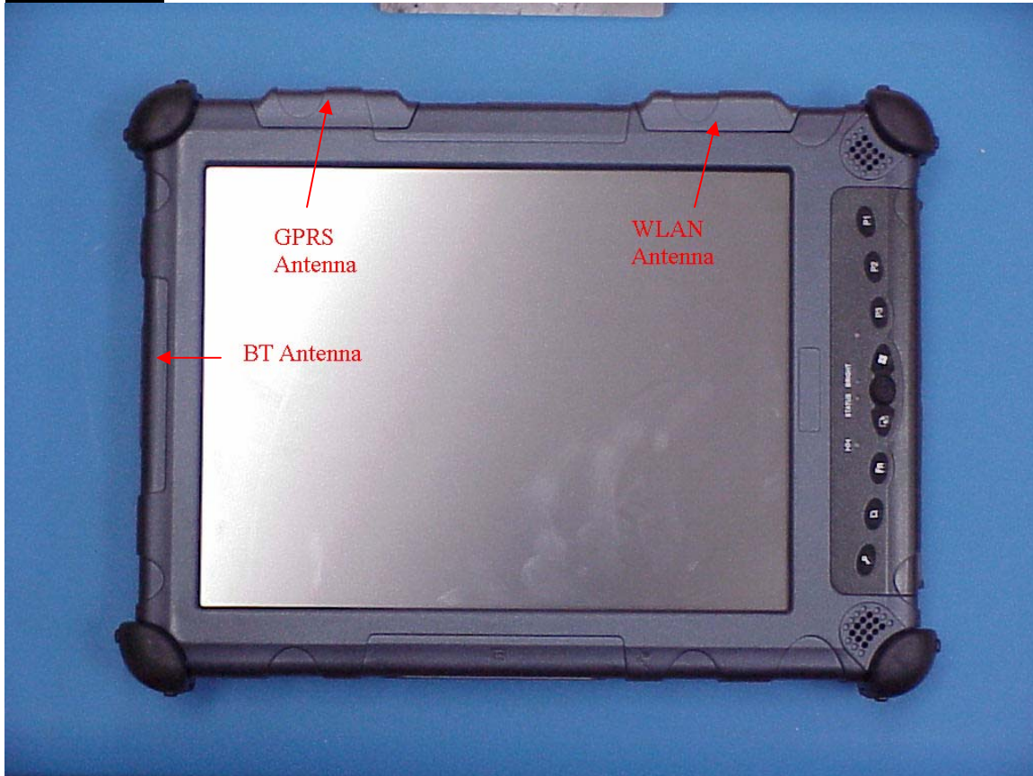
Photo 1. Antenna locations