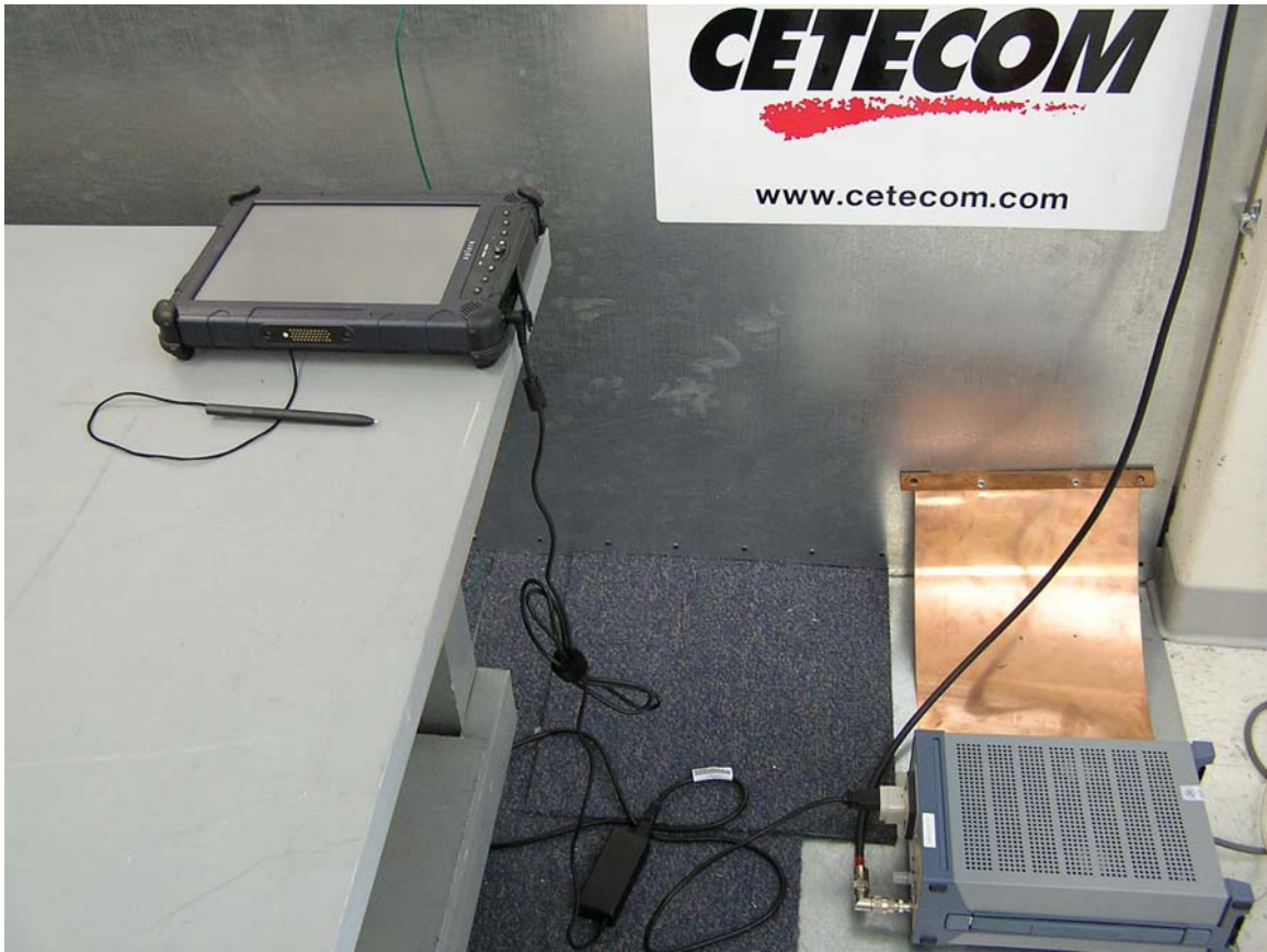
Test setup – AC Line conducted emissions