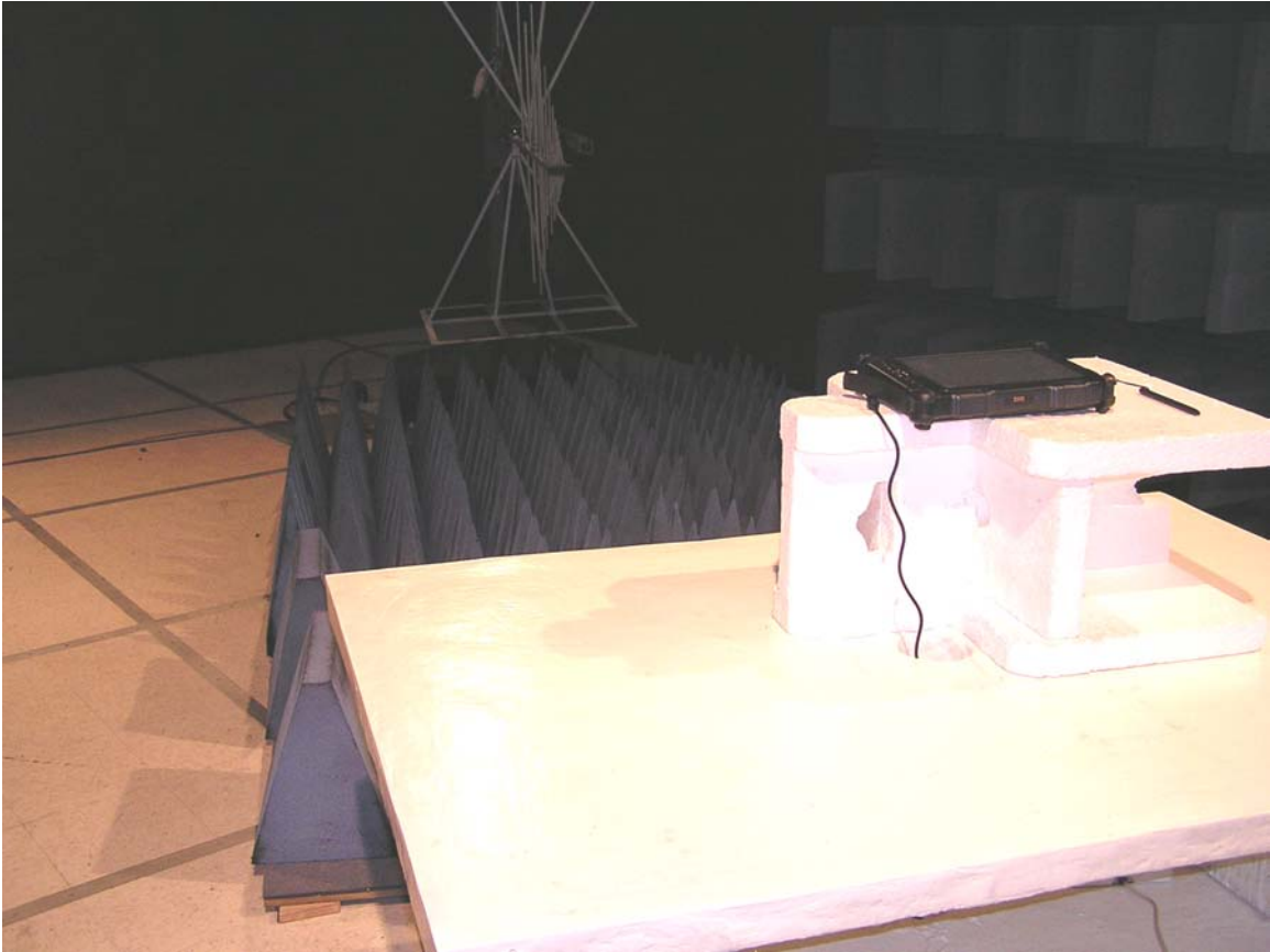
Test setup – Radiated Emissions